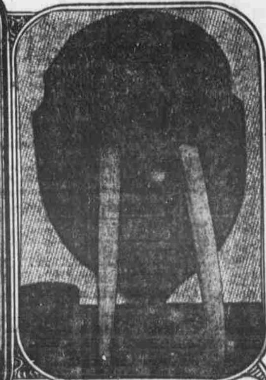
MADRID HEAD THE IVORY TUSKS NEARLY 2 FEET LONG.