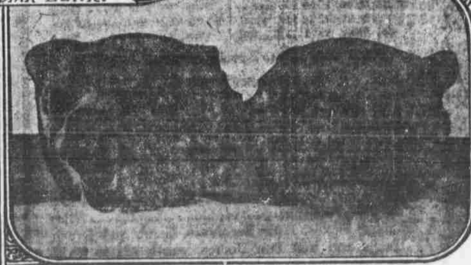
GIANT BROWN BEAR HEADS FROM THE KENAI PENINSULAR, ALASKA.