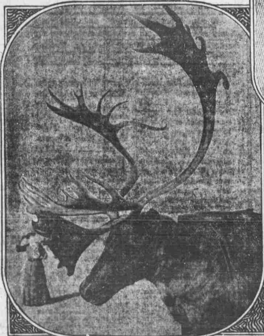
SAID TO BE THE LARGEST AND FINEST CARIBOU HEAD IN THE WORLD.