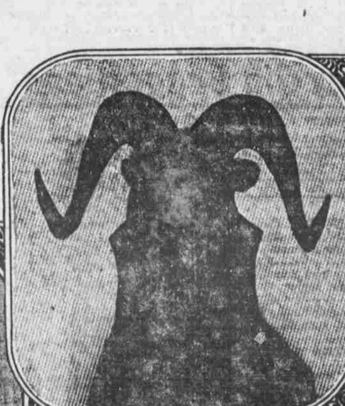
CALLED THE GRANDEST OF ALL HEADS OF THE MOUNTAIN SHEEP.