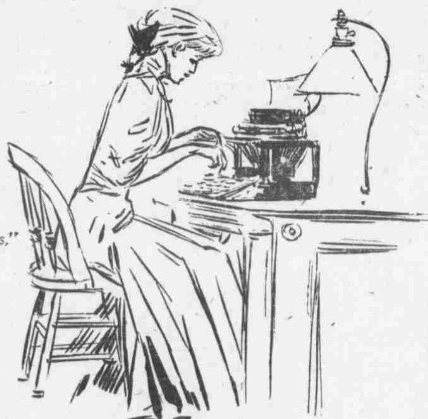
4—She had pencils red and yellow, with points two inches long. A desk and chair, a typewriter she picked up for a song. And in each morning's paper, it made her flush with pride To find the things she wrote herself in columns long and wide.