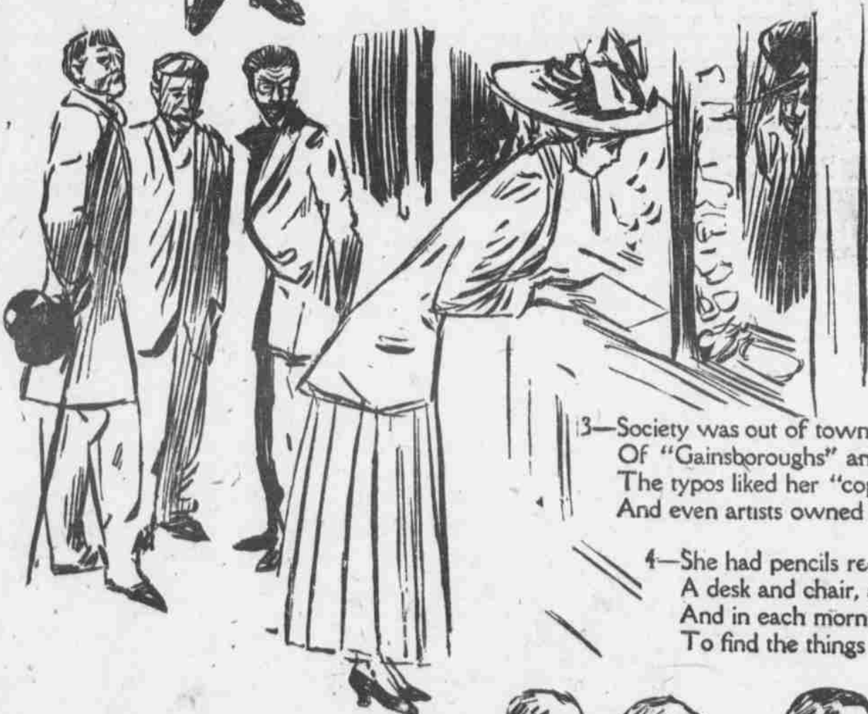
3—Society was out of town, so Fluffy wrote reviews Of "Gainsboroughs" and "Velasquez," of "genre," "wash" and "hues." The typos liked her "copy," it was all so neat and plain, And even artists owned her tastes were decent in the main.