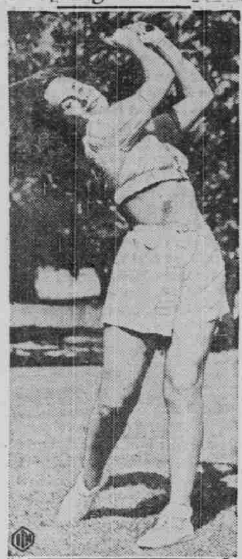
Paulette Goddard When Paulette Goddard, movie star and protégé of Charlie Chaplin, takes to the links, she displays real form, both because of her playing ability and because of the unusual sports costume.