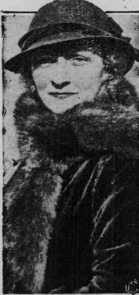
Lady Astor Lady Astor, of London, native daughter of Virginia and the first woman to sit in the British parliament, has indicated that she will retire from public life at the end of her present term. She has represented the constituency of Plymouth since 1919 and has been one of the most publicized liberals in the English house.