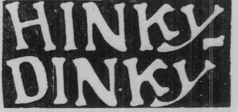
Ad for Plattsmouth, Fri., Sat., May 11 and 12