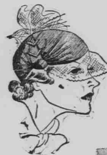
The Parader 2.95