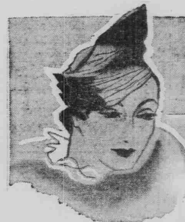
The Peakster 3.95