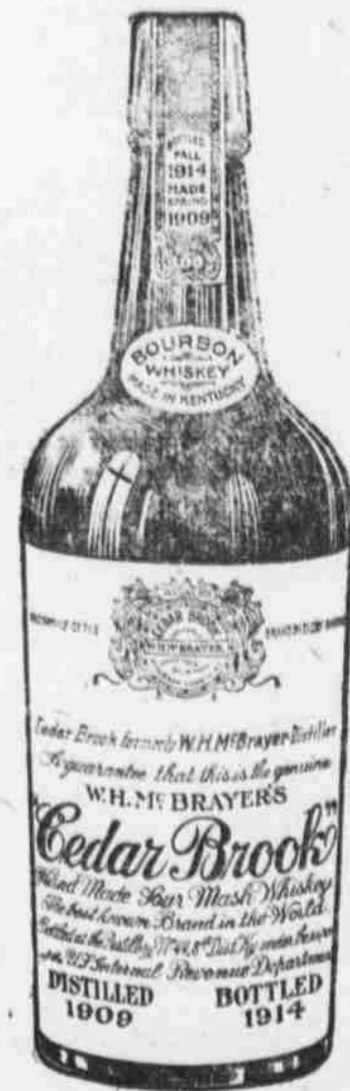
Bottled in Bond

You'll find CEDAR BROOK in the Lead at all Leading Clubs, Bars, Restaurants Hotels and also at all Leading Dealers.