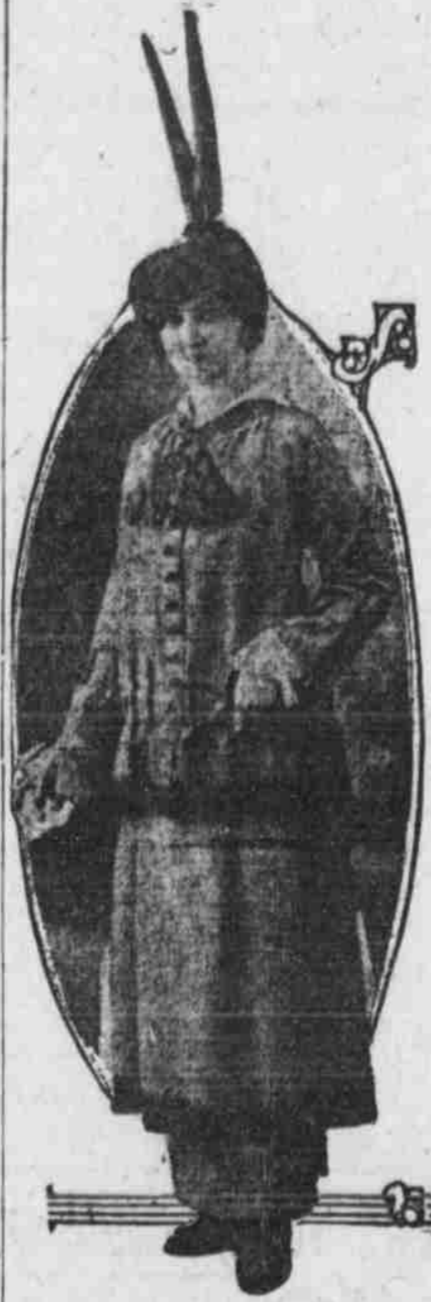
By LA RACONTEUSE.

Quaint suit of mahogany and white checked chevot. The whole gown hangs in a straight line from the shoulders over the narrow underskirt. The coat is gathered up at the neck in a band of chestnut serge bowed in front under a small turned-over collar of white linen.