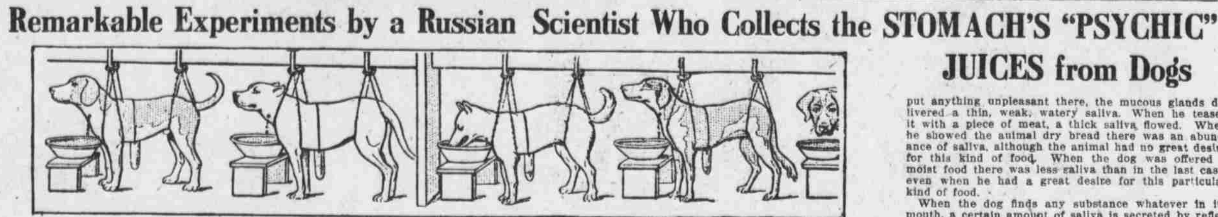
Row of Dogs at St. Petersburg Institute of Physiology with Permanent Openings in Their Stomachs Through Which the Gastric Julces Are Collected.

These openings, strange to say, appear to cause no