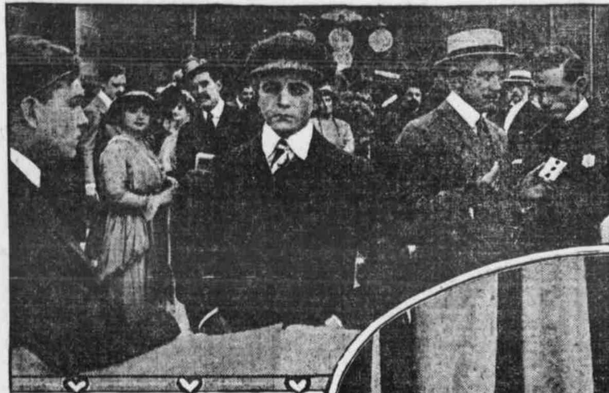
Alan's Appearance at the Hotel Monolith Created a Stir.

On the other hand, it was his true name that he gave to the person whom he called upon by the telephone immediately after being shown to his rooms.