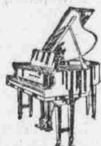
This is a little picture of the