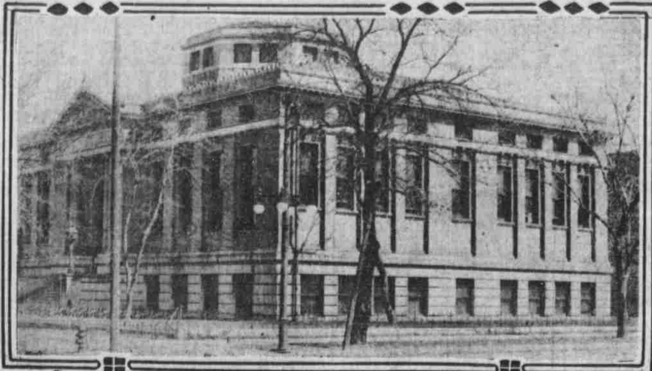
Lincoln Carnegie Library

At the State Farm. One of the prettiest places in Lincoln is the state farm situated about two miles from the present university proper. The farm contains 250 acres and was