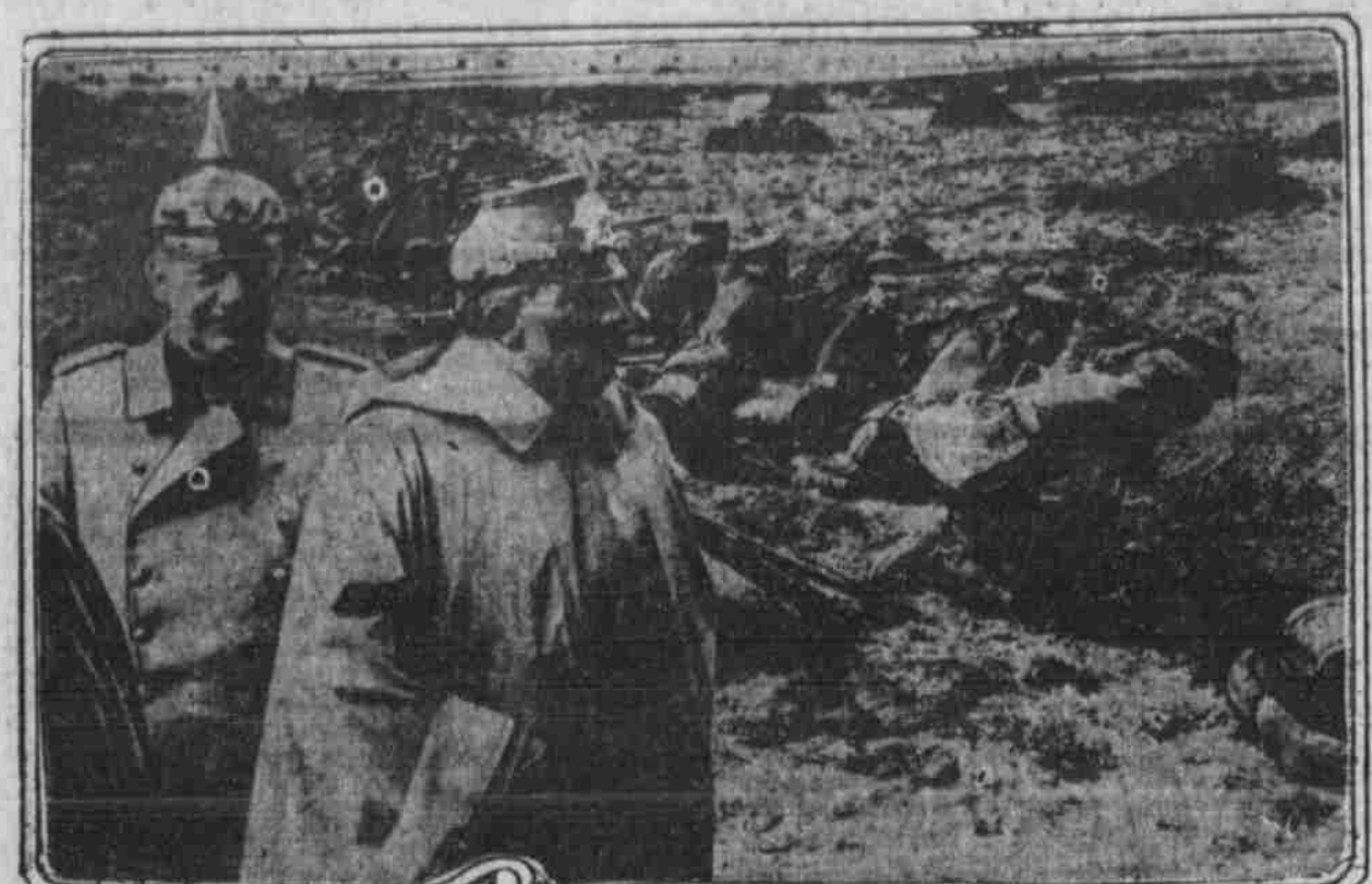
In the insert picture Emperor William II of Germany is seen at the left and his military adviser, General von Moltke, at the right. The Kaiser is reported to have started from Berlin for Mainz with his general staff. The background picture was taken while the fighting around Liege was in progress. It shows Ger-