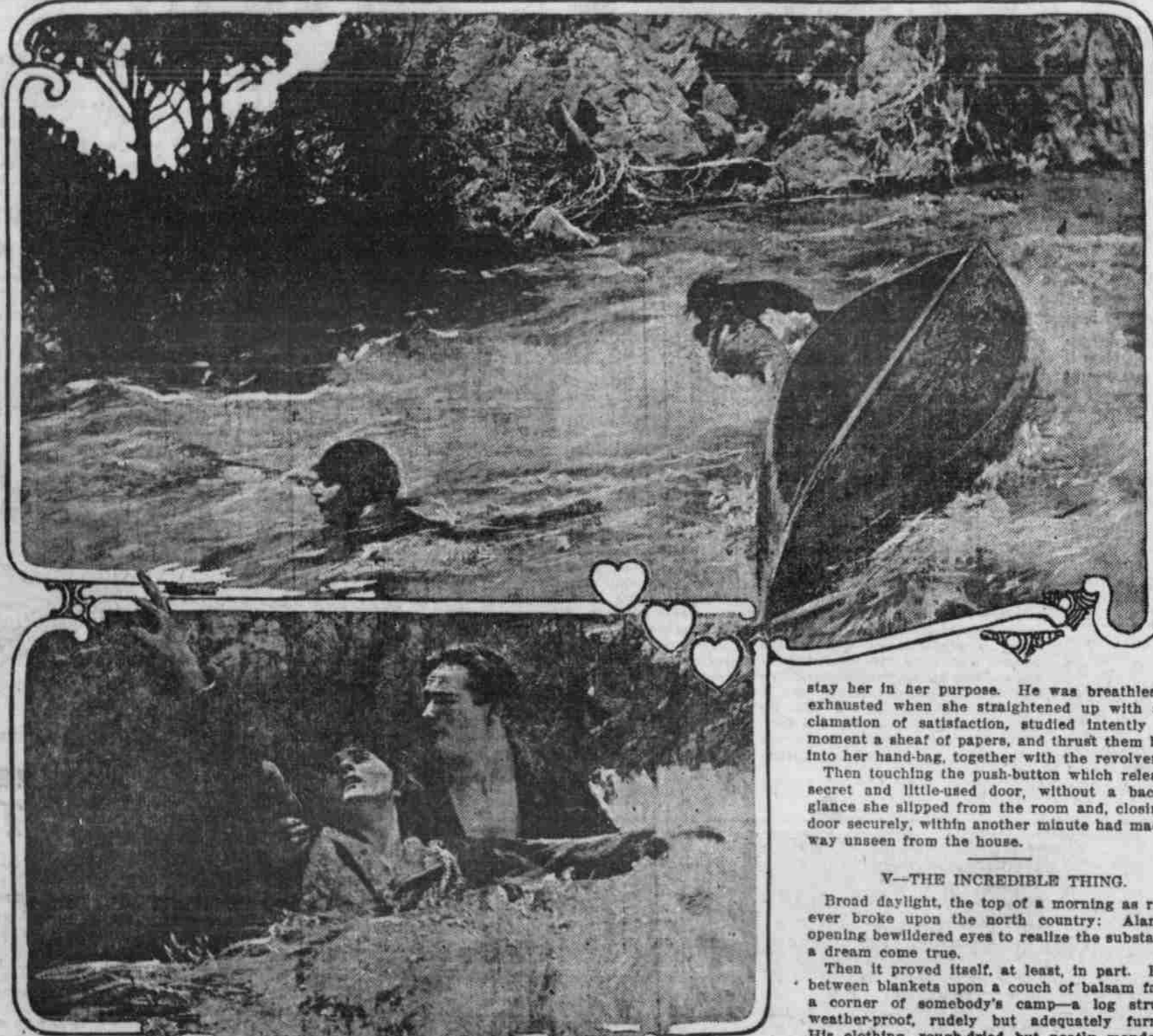
And the Canoe Swam Broadside to a Boulder, Turned Turtle and Precipitated Both Headlong into the Savage Water—To Collapse, Exhausted Against the Bank.

"If you will permit me to say so—now that one sees you, Miss Trine, it is quite comprehensible why my employer—ah—feels toward you as he does."