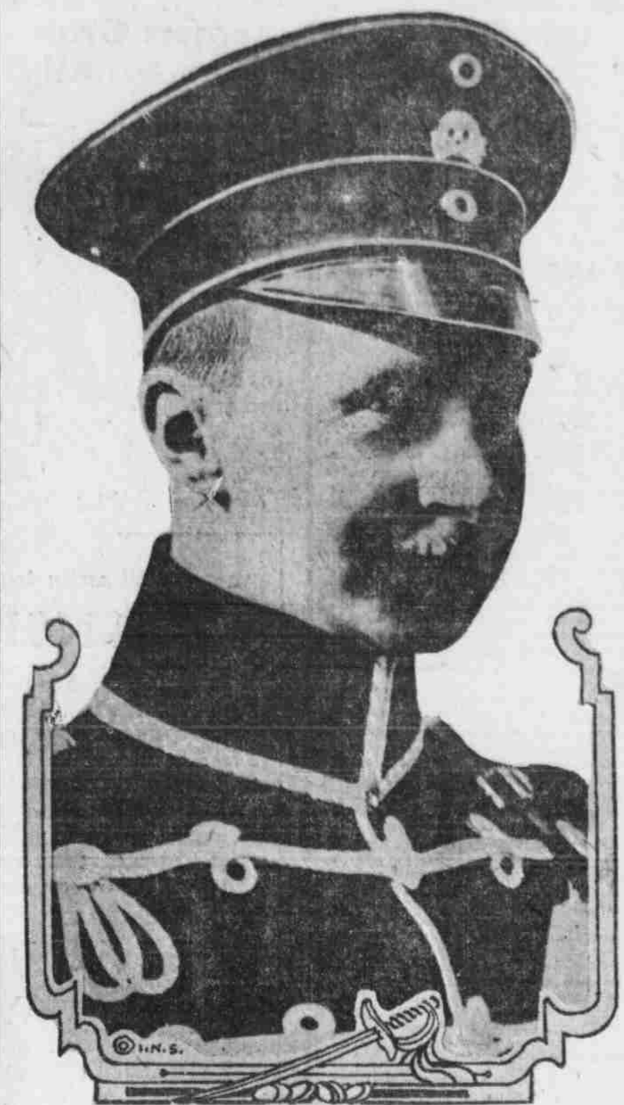
FREDERICK WILLIAM, Crown Prince of Germany.