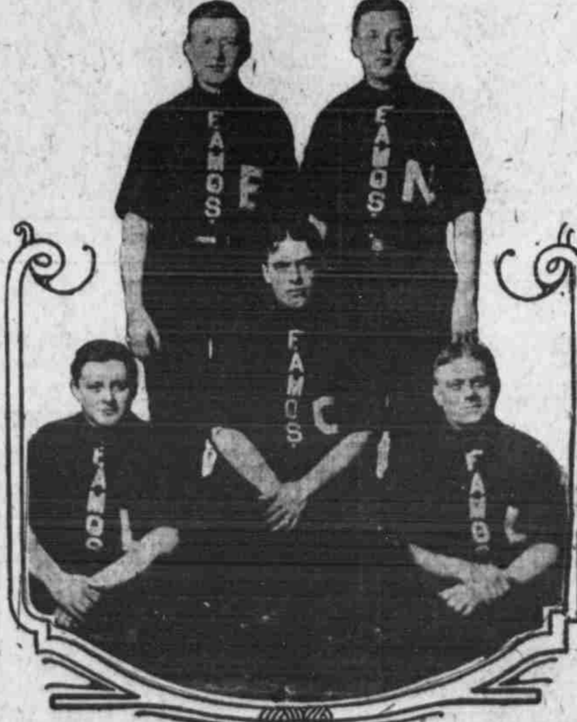
The famous "Famous" team of the Grand Island Federal league started out poor, but are now giving the topnotchers

leagues, have disbanded for the season. The First Christians have called off their game with Cosner at Reihany, which was to be played the latter part of this month. As a climax to the First Christian-Hanson Park game Tuesday evening, the Christians won their hardest played game of the year by the score of 13 to 13. All basket ball games have been called off that were to be played on the Nebraska School for the Deaf gymnasium, because of the use of that building as a dormitory by the students. Two games of thirty minutes duration will be played between the Council Bluffs Cubs and the Young Men's Christian association Secretaries, when they meet Tuesday evening to make up for a postponed game. Following the close of the Tri-City league, the Townsends are to reorganize immediately for next season. The Town-