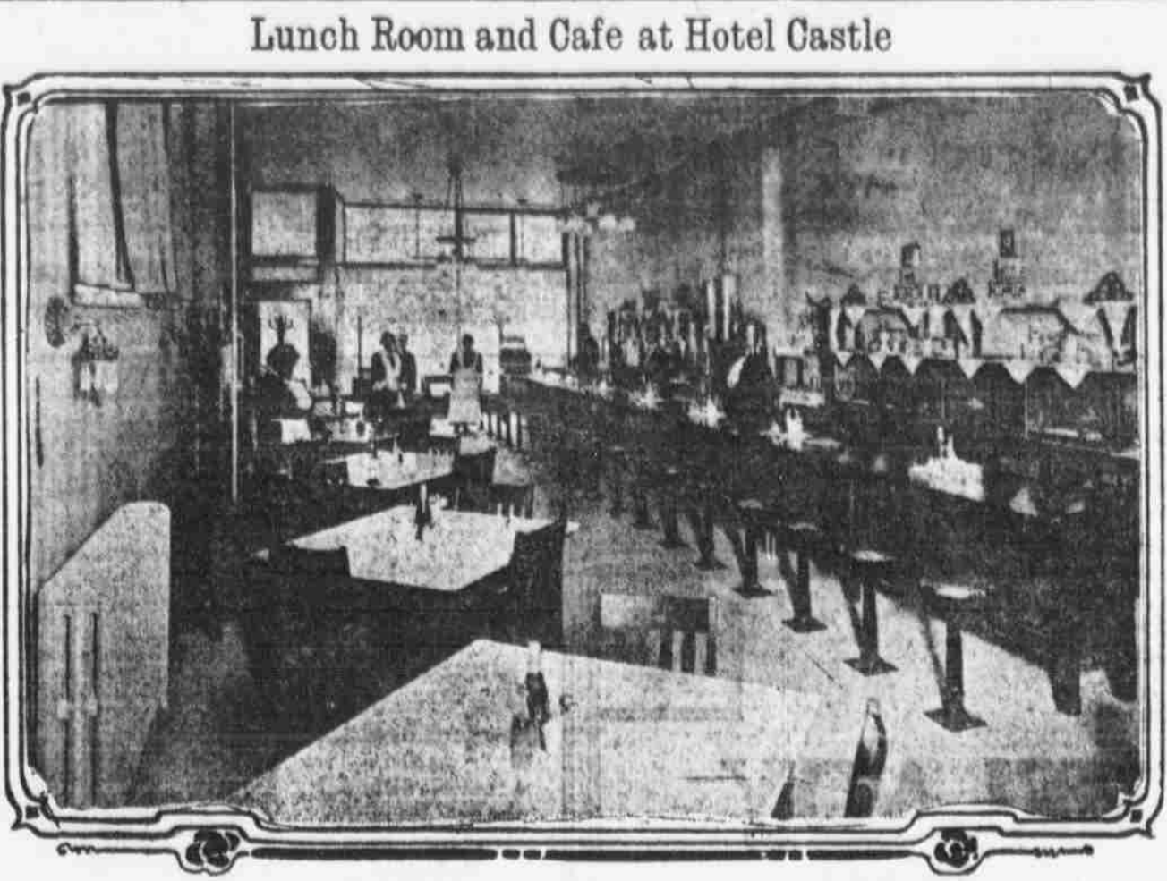
Lunch Room and Cafe at Hotel Castle

NEW YORK, March 20.—The American steamer Lorenzo and the Norwegian steamer Thor, captured last September by a British cruiser in West Indian waters while they were delivering supplies to the German raider Karlsruhe, sailed March 5 and 6 for England with British crews aboard, according to passengers of the steamer Parama, which