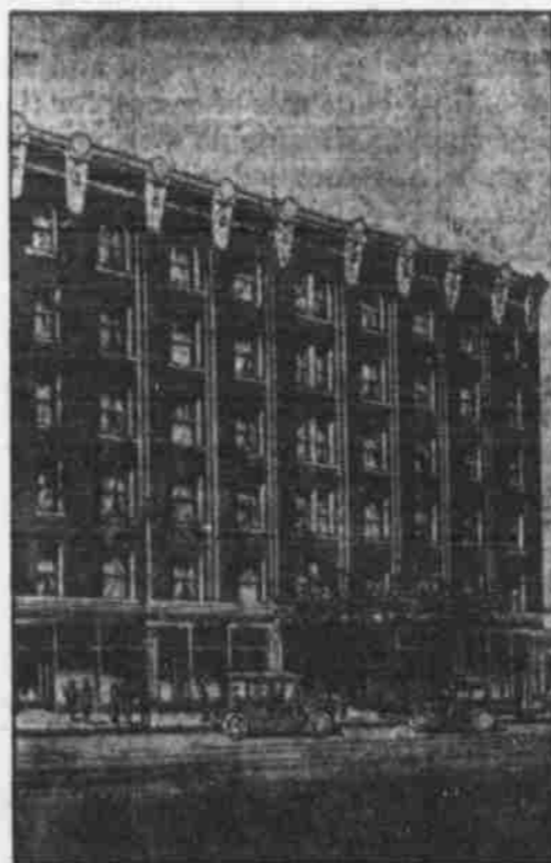
The New Hotel Castle