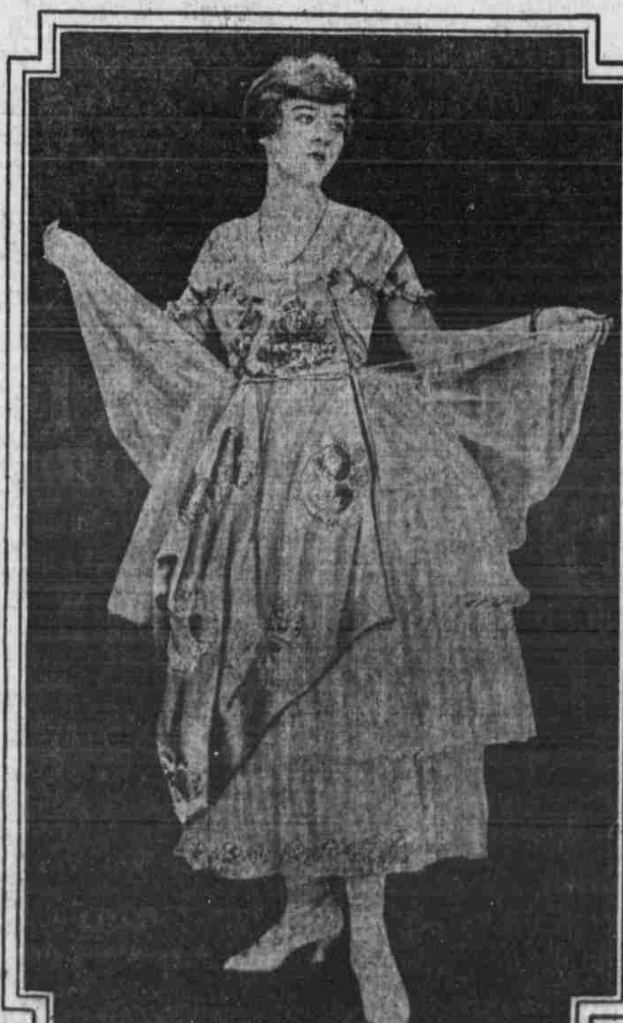
Hoop-Skirt Dress of Blue Tulle and Blue and Silver Brocaded Taffeta, with Silver Stockings, Shoes and Wig.

You may always, indeed, take it for granted that each dress is provided with a flesh-colored foundation whose chief aim and object it is to make its presence as unobtrusive as possible! And, remembering this, you can try to realize the effect of a sleeveless corsage of silver gauze crossed by wide scarves of sapphire blue panne, which are eventually caught together on one hip by a cluster of damask roses. The full skirt beneath is of delicate pink chiftropical sky at night, at first just broidered with a light tracery of dull gold, which soon, however, grows bright and bold and beautiful, too, tinsel ribbon of gold and affver being interwoven with the metallic threads. And finally, shimmering out through the blue with a moon-like radiance, a fold of silver tissue is deftly introduced between a dou-ble fold of the blue tulle at the akirt