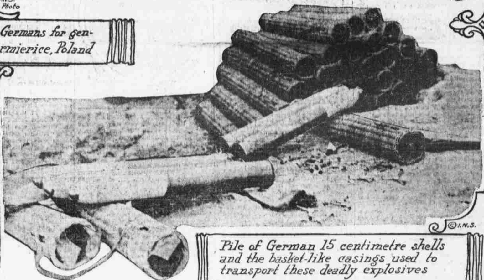
Pile of German 15 centimetre shells and the basket-like casings used to transport these deadly explosives