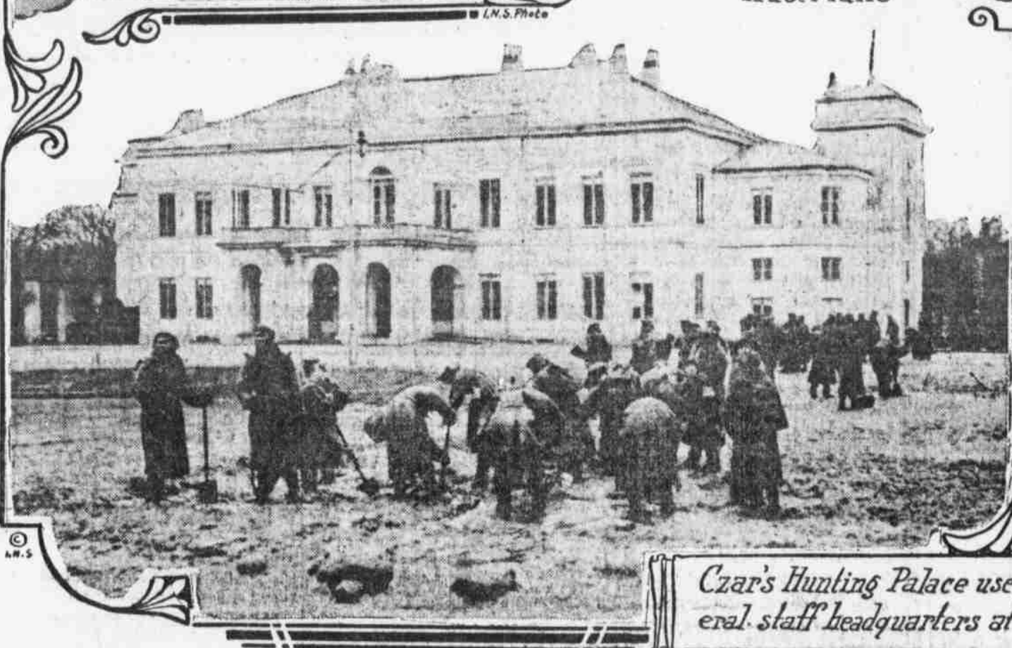
Czar's Hunting Palace used by Germans for general staff headquarters at Skiermierce, Poland