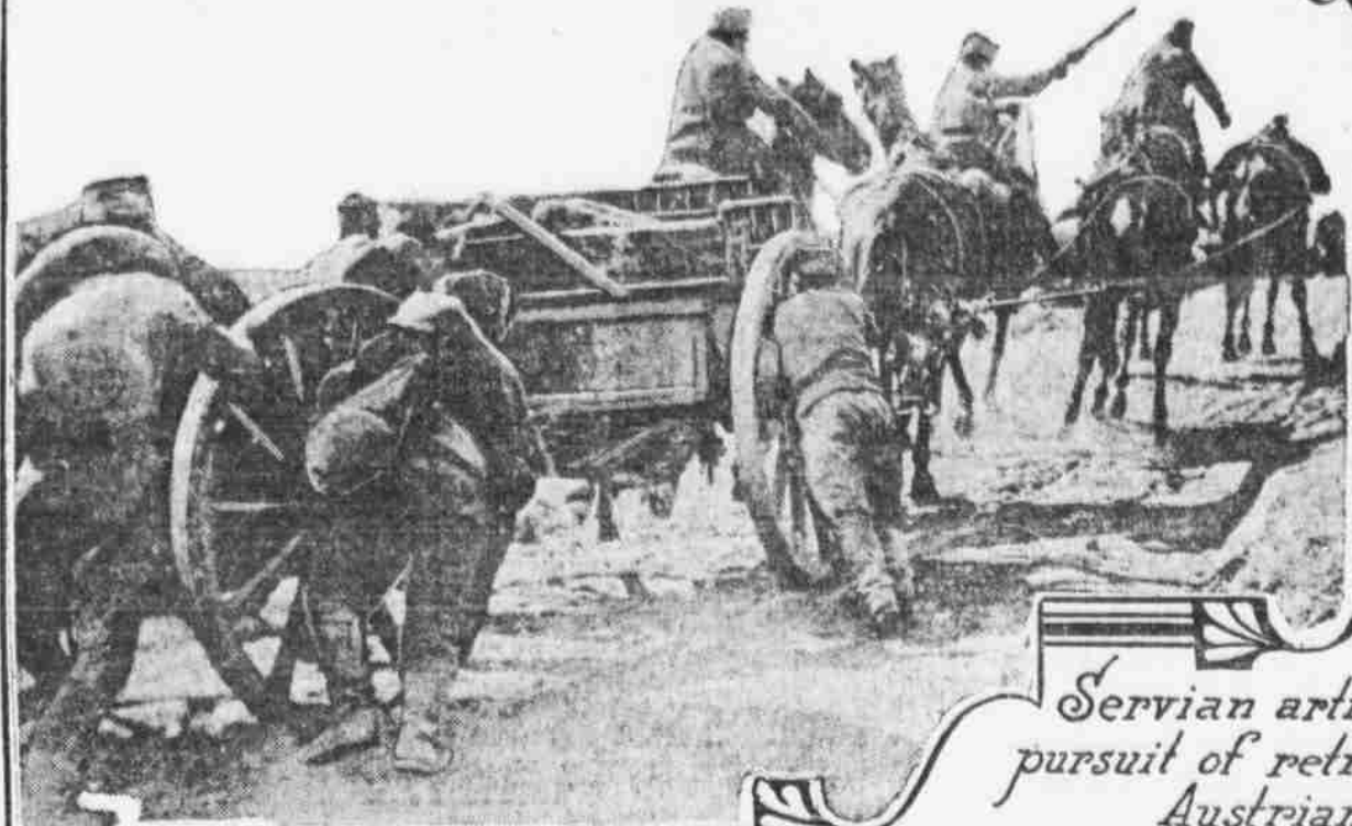
Servian artillery in pursuit of retreating Austrians