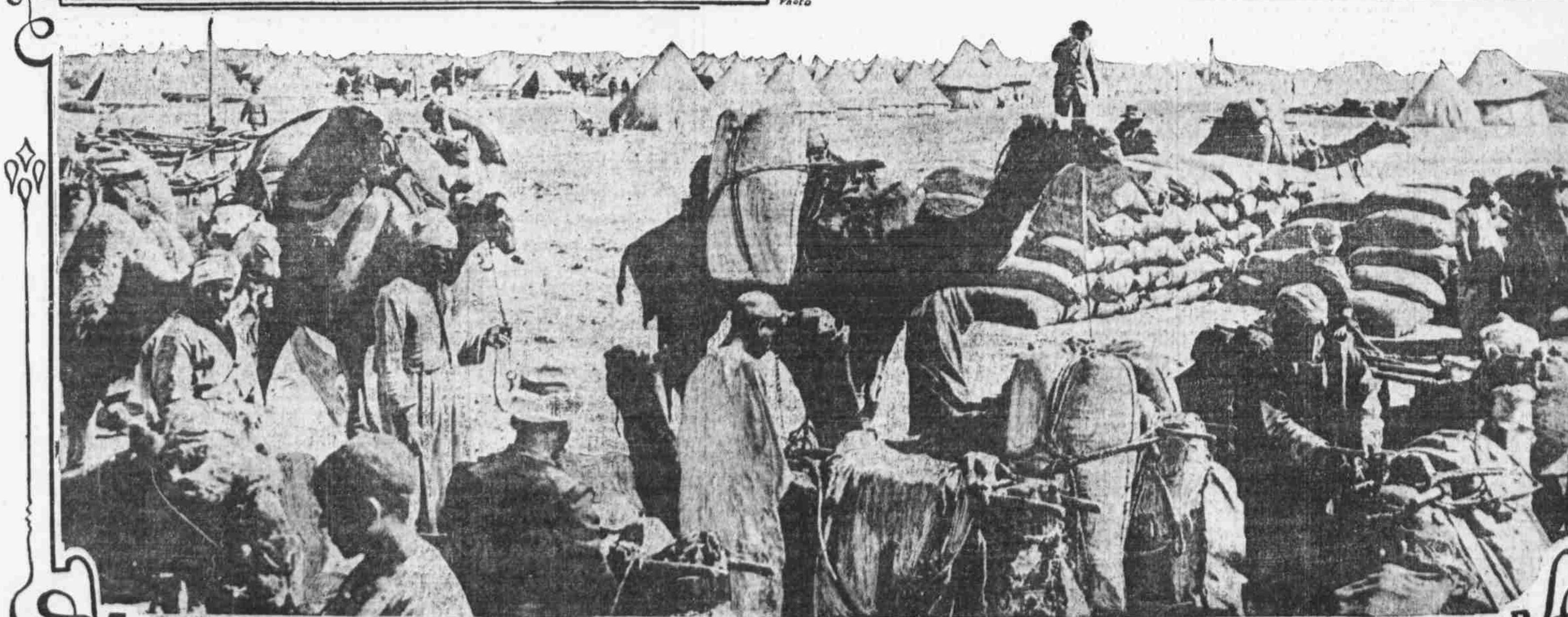
Camels unloading crushed barley for the British army at their camp near Cairo