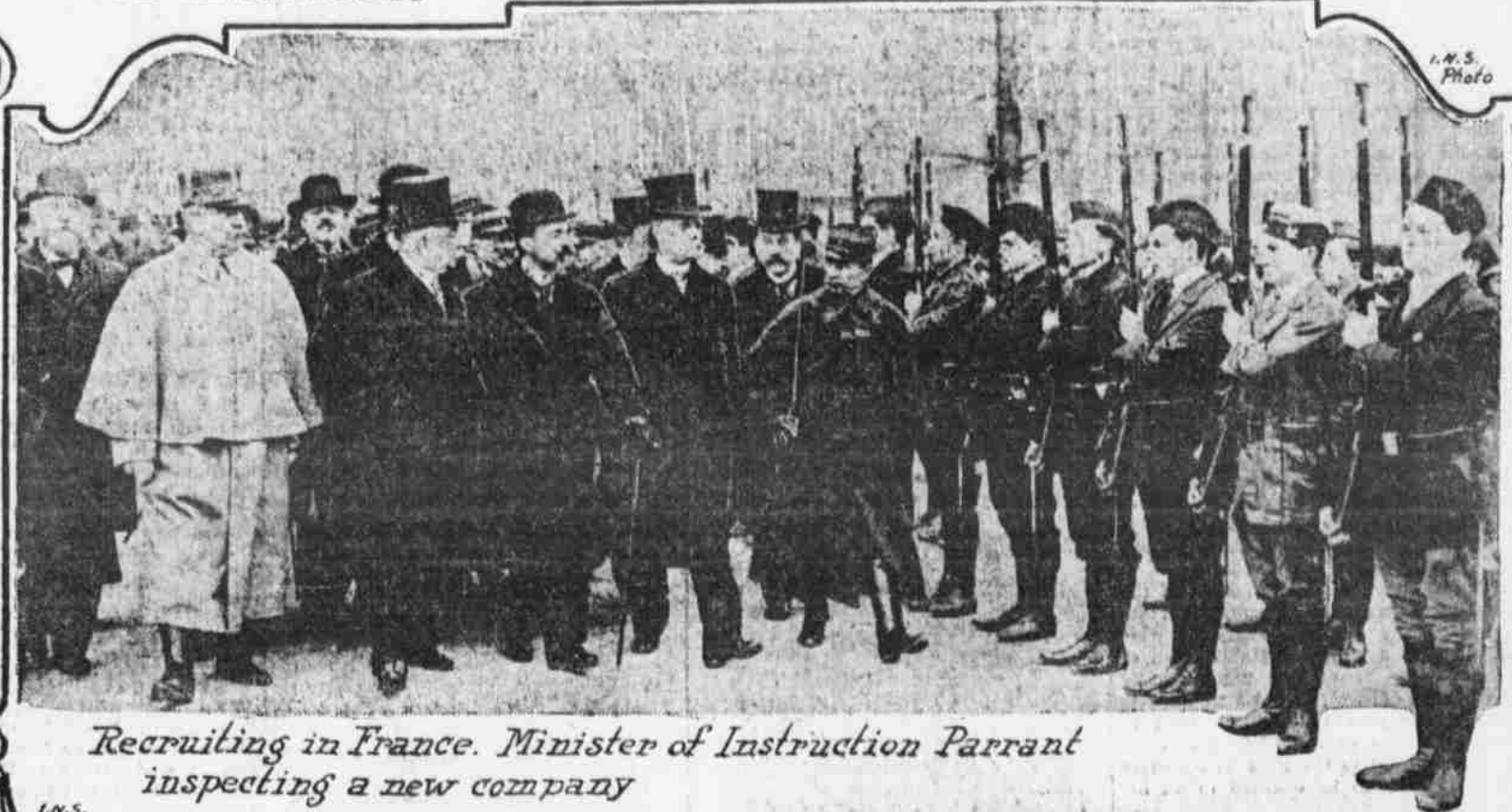
Recruiting in France. Minister of Instruction Parrant inspecting a new company