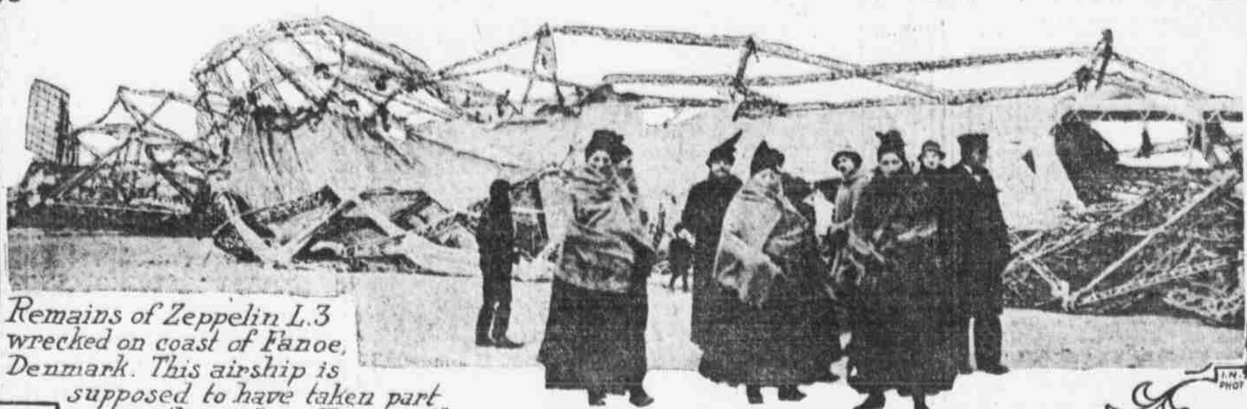
Remains of Zeppelin L.3 wrecked on coast of Fanoe, Denmark. This airship is supposed to have taken part in the raid on Yarmouth