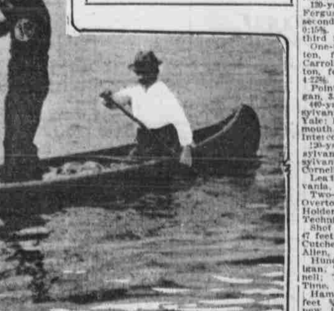
Canoeing is more than ever popular at Carter Lake this year, and the club members are taking advantage of the clear weather when it comes for the joys of this delightful sport.