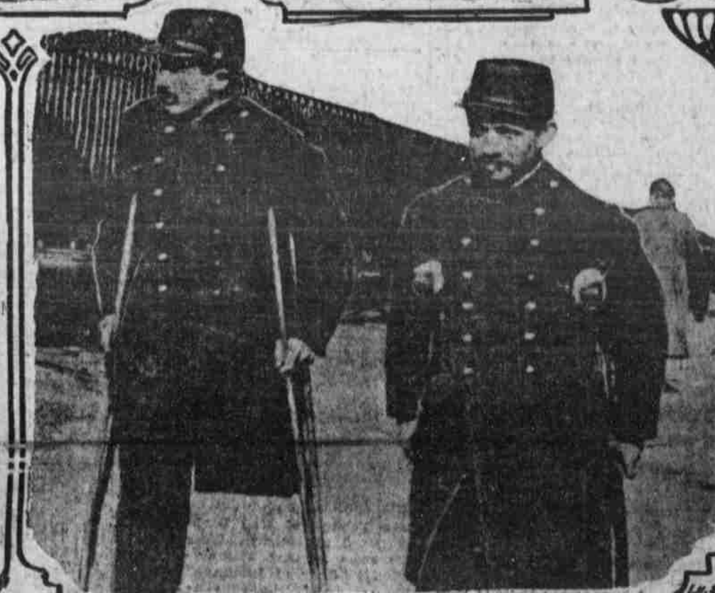
Two French soldiers invalided each minus a leg