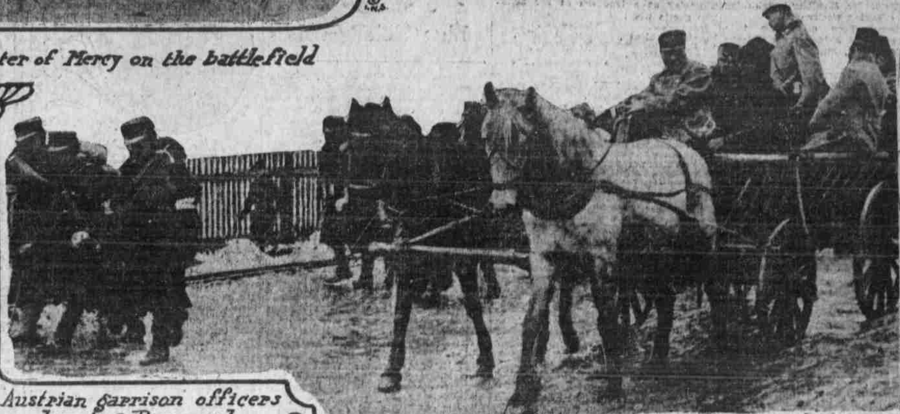
Austrian garrison officers leaving Przemysl