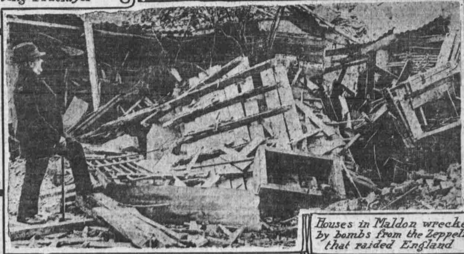
Houses in Maldon wrecked by bombs from the Zeppelins that raided England