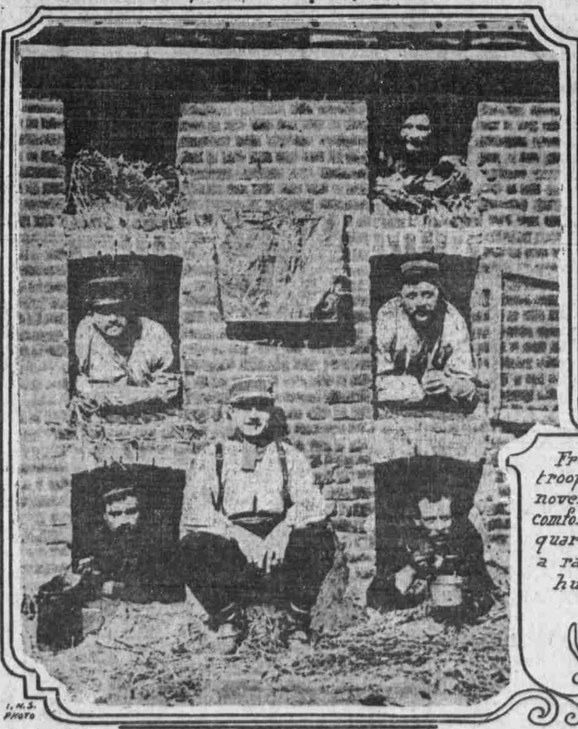
French troopers in novel but comfortable quarters in a rabbit hutch