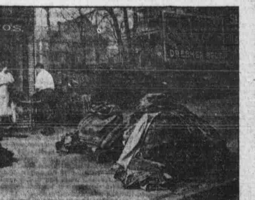
Illustration Shows the Empress Velvet Drop Curtain Being Received at Dresher Brothers Cleaning and Dyeing Plant