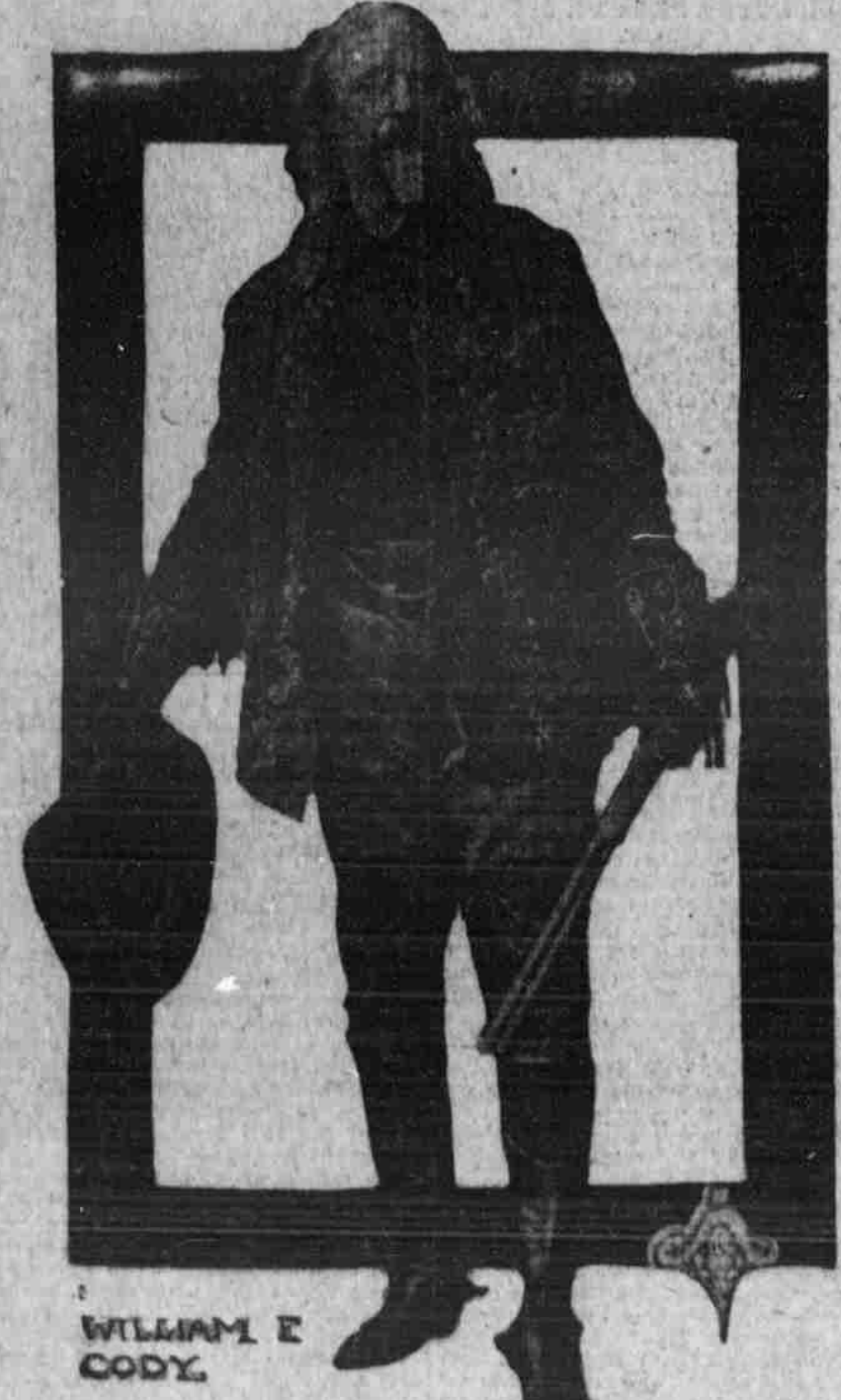
WILLIAM F. CODY.

"BUFFALO BILL" will henceforth be known as General William F. Cody, because he has been appointed judge advocate general of the military forces of Wyoming by Governor Kendrick.