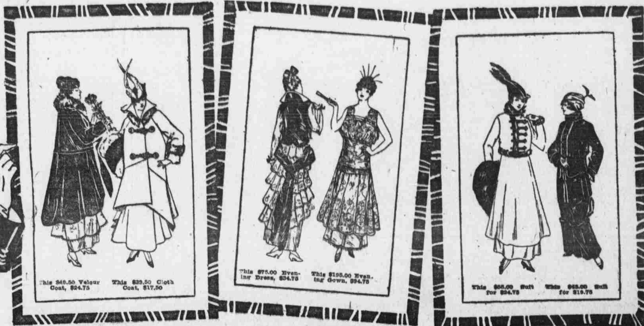
This $45.50 Velvet Coat, $24.75