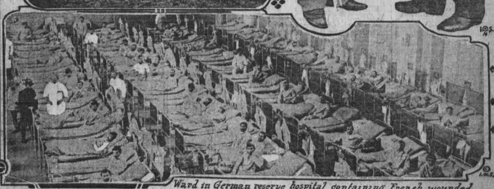
Ward in German reserve hospital containing French wounded