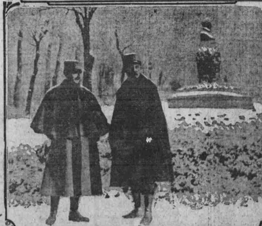
First snow at the front catches these French officers in the square at Bolougne