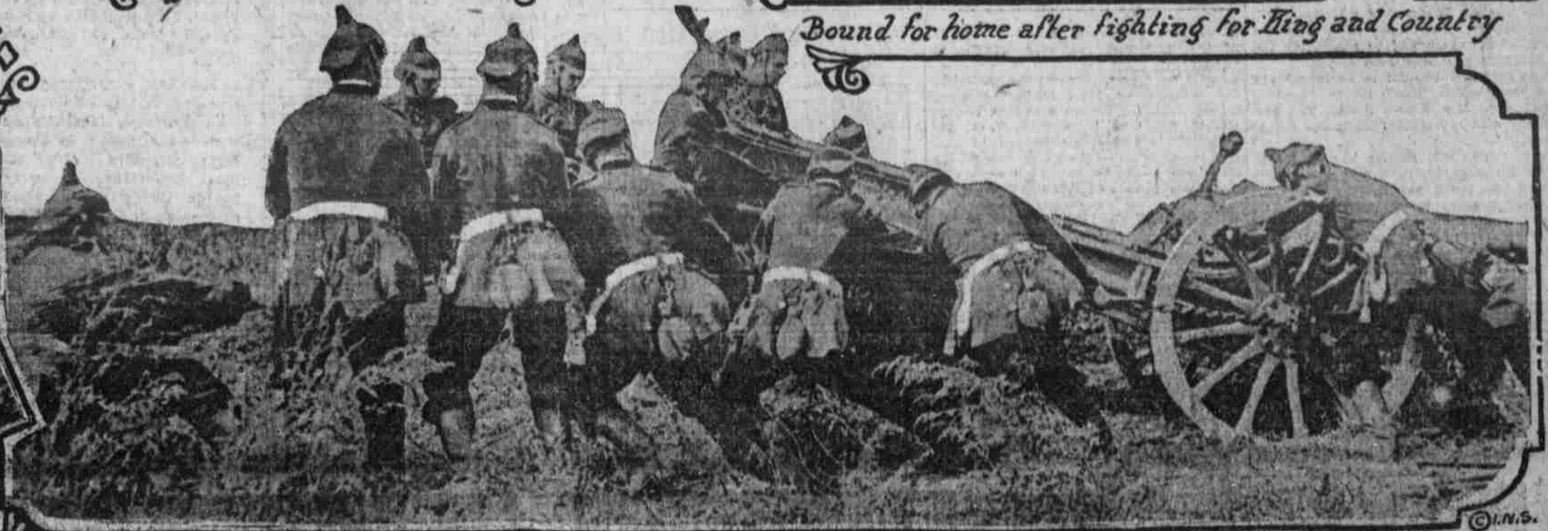
German artillery men wheeling heavy field gun into position