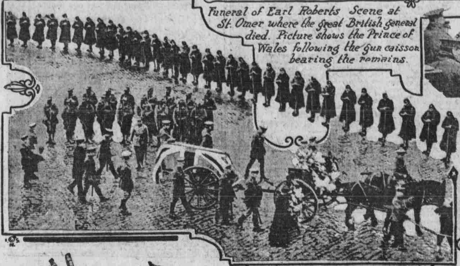
Funeral of Earl Roberts Scene at St. Omer where the great British general died. Picture shows the Prince of Wales following the gun caisson bearing the remains.