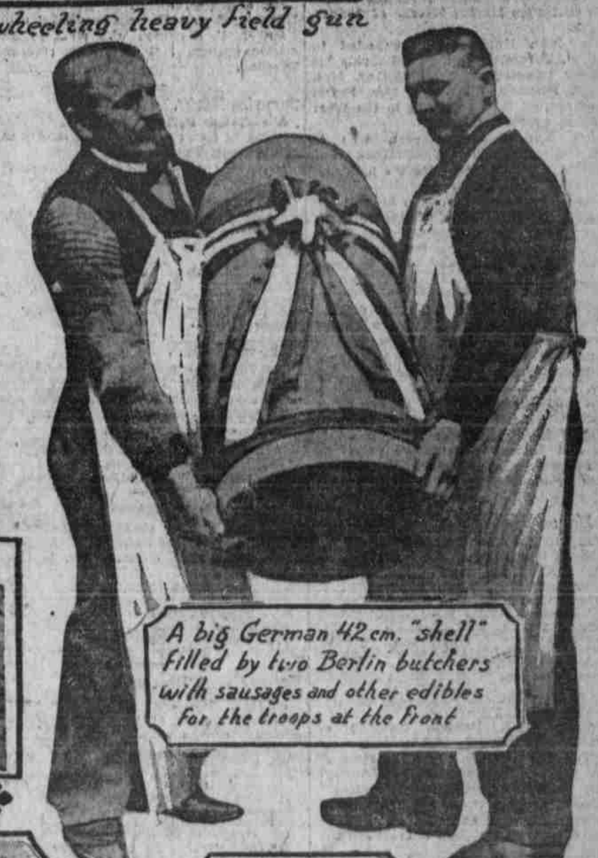
A big German 42 cm. "shell" filled by two Berlin butchers with sausages and other edibles for the troops at the front