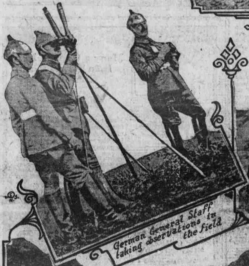
German General Staff taking observations in the field