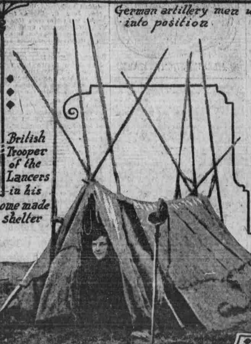
British Trooper of the Lancers in his home made shelter