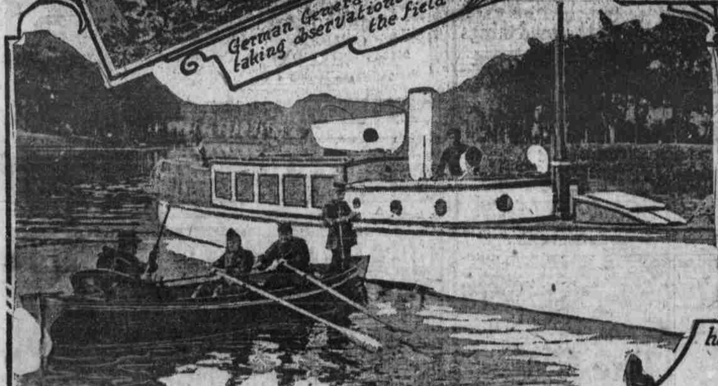
Dutch exercising strictest guard on neutrality on the Scheldt