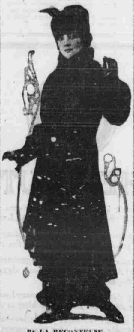
By LA RECONTEUSE.

Calot suit, redingote of black satin, belted with embroidered jet beads, collar and front banded with skunk. Straight velvet skirt banded around bottom with skunk.