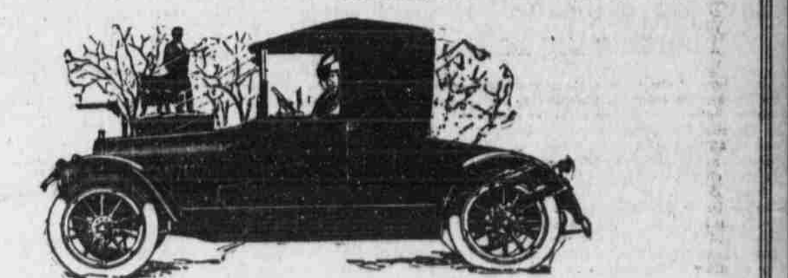
A Closed-in Coupe While It Snows The 1915 HUDSON Six-40 Cabriolet Price $1750, f. o. b. Detroit