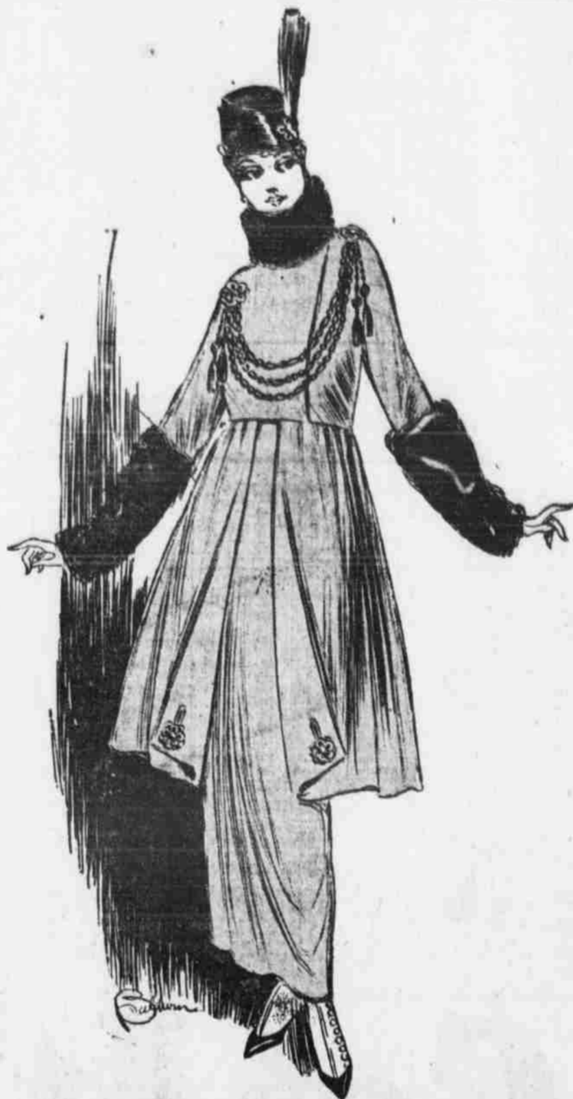
A type of military suit associated with heroines of literature has become the inspiration for the modern costume. It is made of blue cloth trimmed with sealskin.

With this costume was worn an odd little hat, built somewhat like the headgear of the Cossacks. It was of velvet of a buff tone, banded with sealskin and having, by way of ornament, a stiff brush aligrette headed by a gold braid rosette. The girl wearing this military toggery was not in the least of the Amazon type. On the contrary, she was rather a demure little object with chestnut brown hair and blue eyes, the cerulean tones of the latter being intensified by the blueness of the costume.