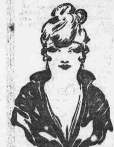
"If You Could Have Seen the Pimples I Used to Have, The 'Nasty Things'!"

The quick action of Stuart's Calcium Waters cannot be described. One must see the effect on the skin after only one or two days. They reach down into the blood, clean it as one does dirty linen, throw off all impurities in a natural way and thus the blood does not fill the skin with eruptions and discolorations in its attempt to get rid of injurious waste.