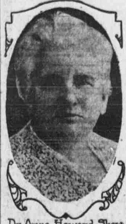
Dr. Anna Howard Shaw