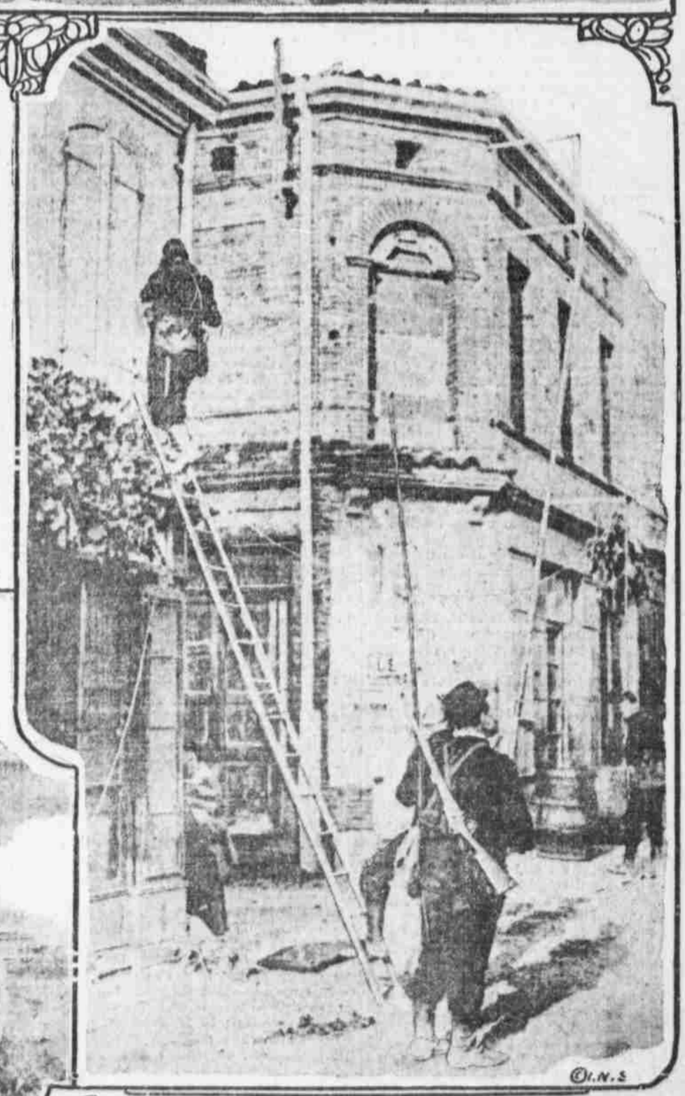
Re-establishing a line of communication French soldiers pulling up telegraph lines through a village to the south of Noyon which the Germans had destroyed