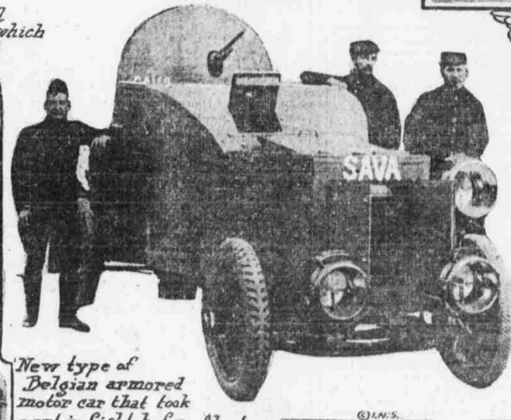
New type of Belgian armored motor car that took part in fight before Alost