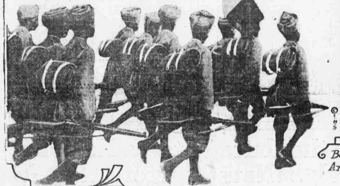
Indian Troops in France carrying French flag presented to them by residents of one of the French towns through which they passed