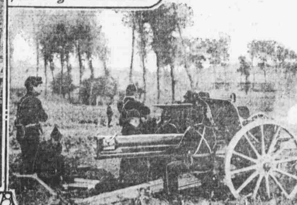
With the Belgians on the firing line near Alost