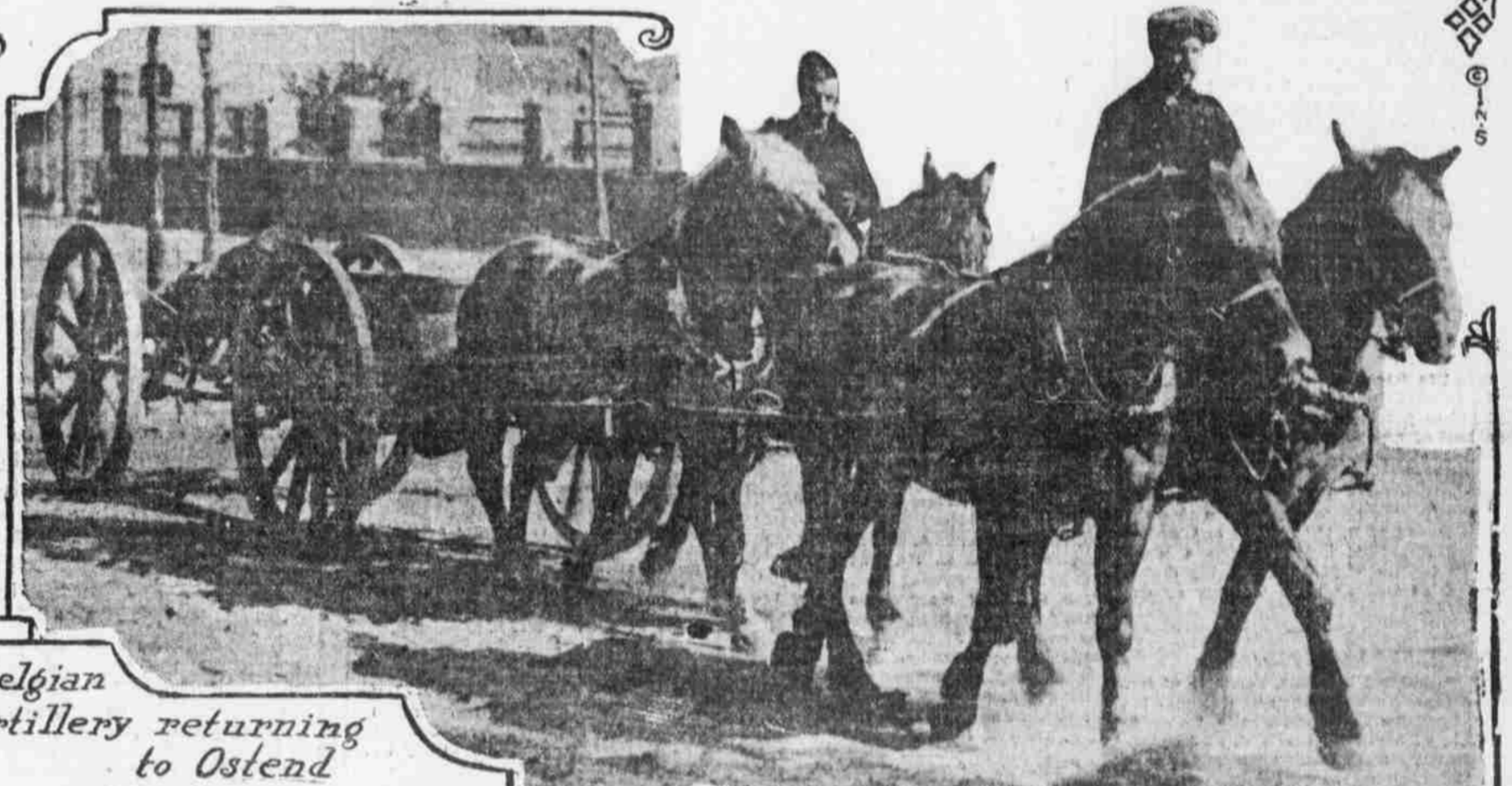
Belgian Artillery returning to Ostend