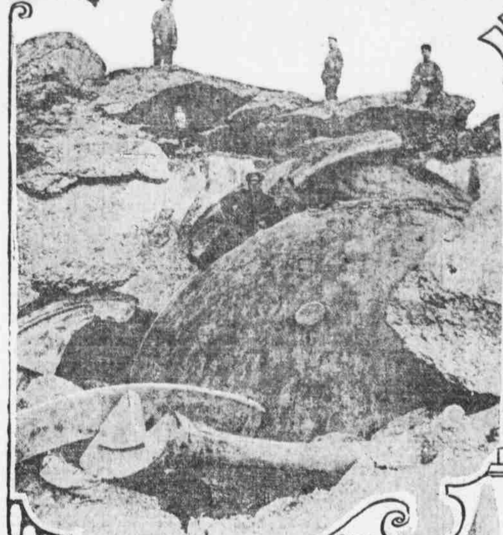
One of the impregnable Ports at Namur after the German gunners got range of it.