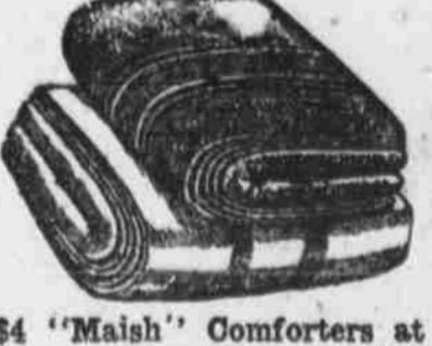
$4 "Maish" Comforters at $2.95 Each.

Plush robes and in black and fancy colors, also the all wool fancy plaid steamer robes, $6.00 values at, each, $3.98