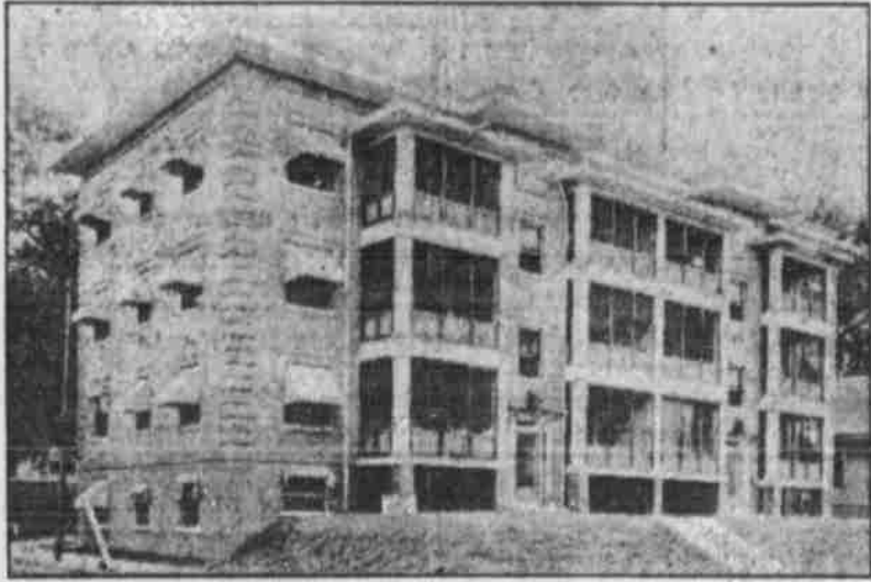
THE NATHAN APARTMENTS