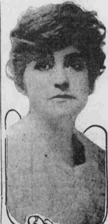
Mrs. Fiske as Becky Sharpe in Vanity Fair At the Boyd