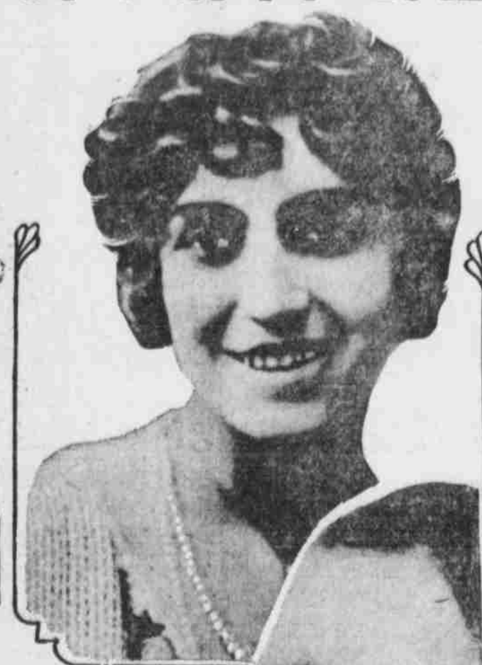
Soloist with The Mexicans At the Orpheum