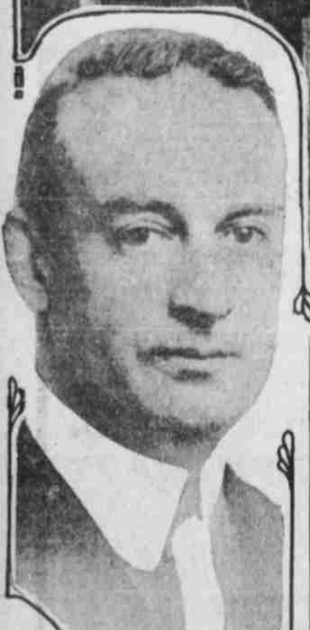
At the Orpheum William Morris