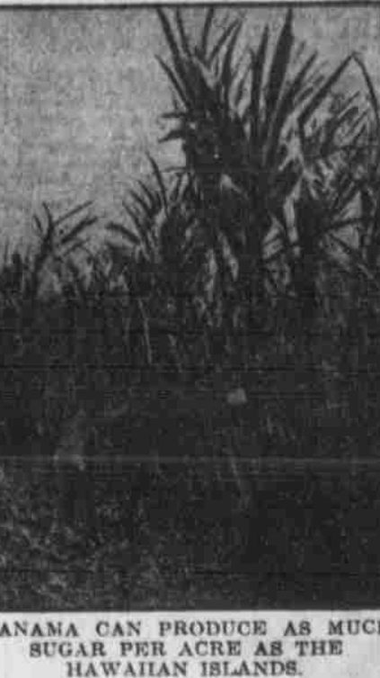
PANAMA CAN PRODUCE AS MUCH SUGAR PER ACRE AS THE HAWAIIAN ISLANDS.