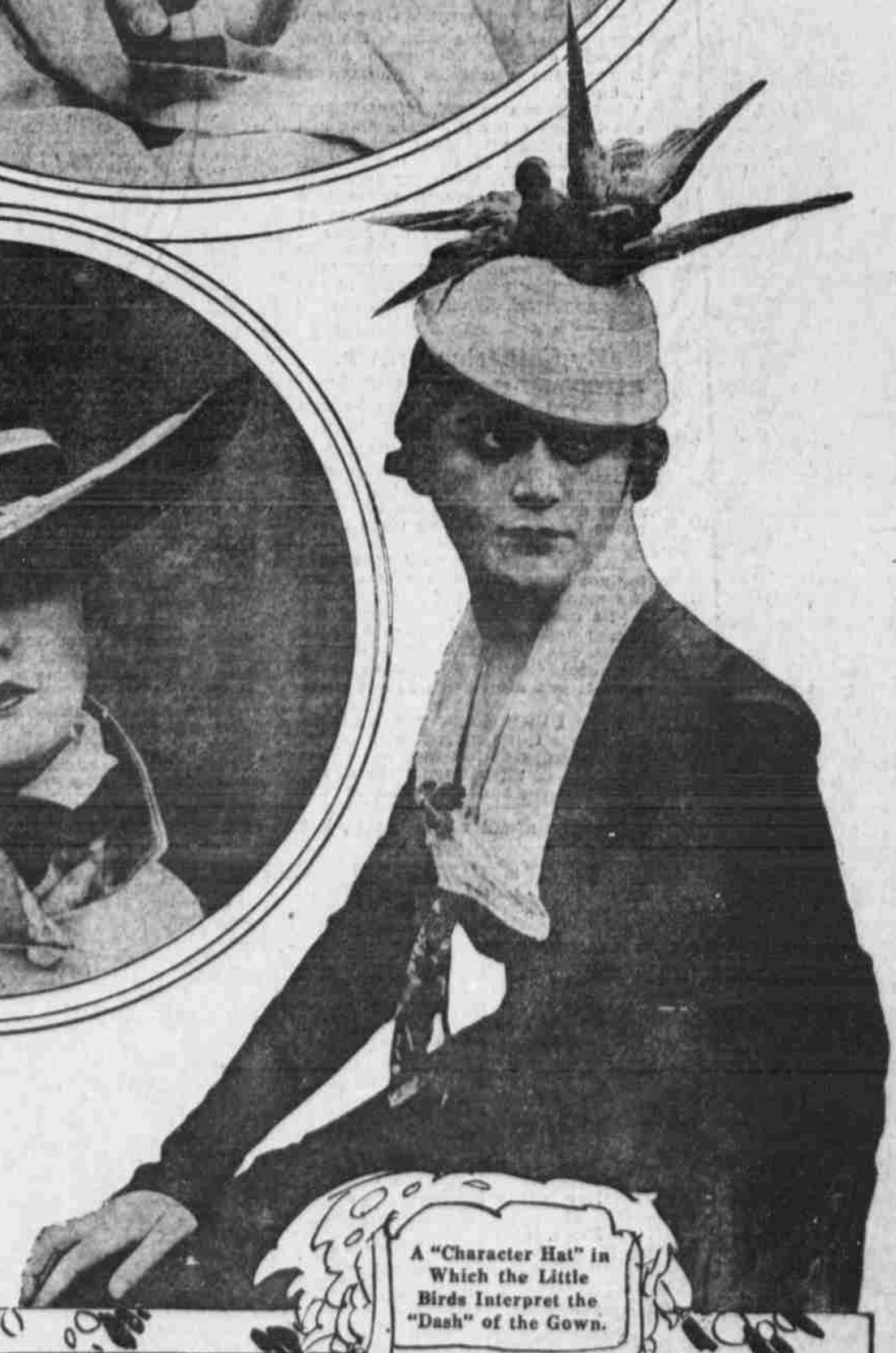
A "Character Hat" in Which the Little Birds Interpret the "Dash" of the Gown.