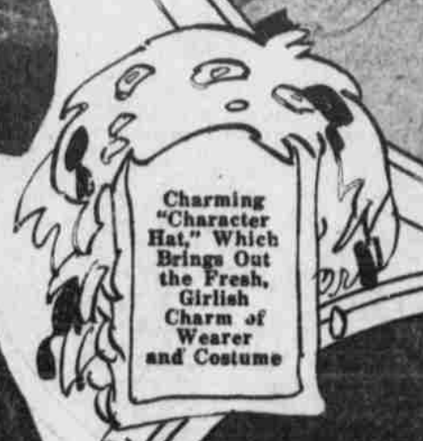
Charming "Character Hat" Which Brings Out the Fresh, Girlish Charm of Wearer and Costume