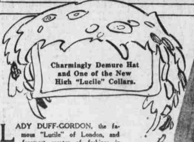
Charmingly Demure Hat and One of the New High "Lucile" Collars.

LADY DUFF-GORDON, the famous "Lucile" of London, and foremost creator of fashions in the world, writes each week the fashion article for this newspaper, presenting all that is newest and best in styles for well-dressed women. Lady Duff-Gordon's Paris establishment brings her into close touch with that centre of fashion.