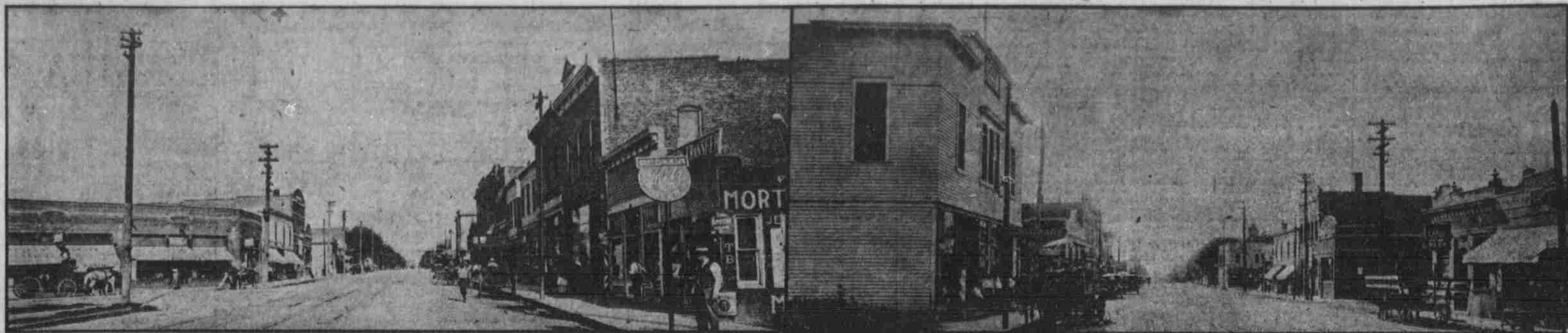
MAIN STREET, BENSON, LOOKING EAST FROM FIFTY-NINTH STREET.