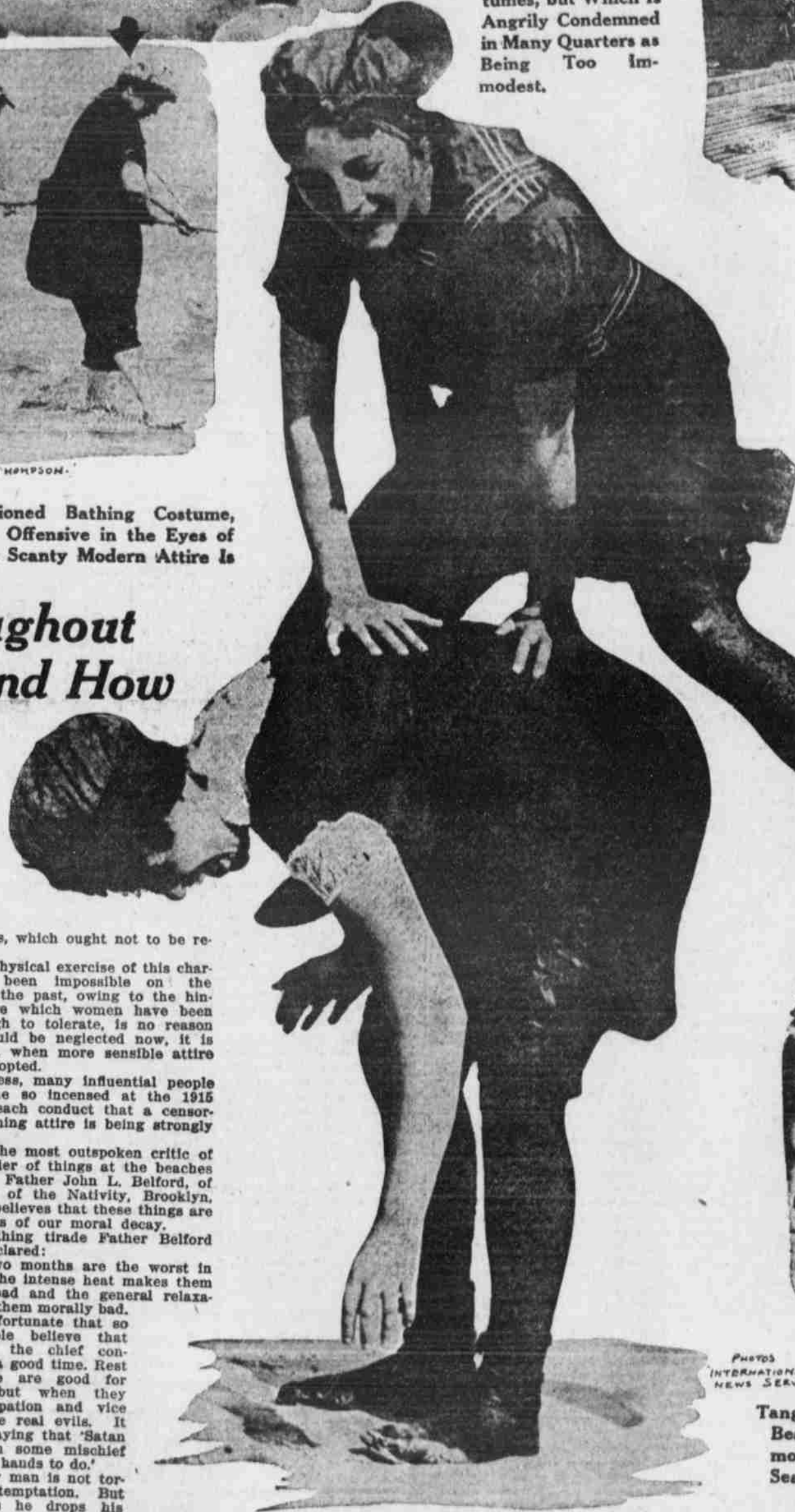
Tangoing on the Beach, a Common Sight This Season.