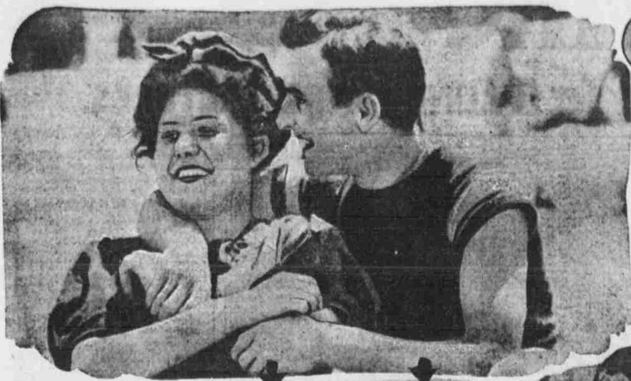
A Type of Open Air Demonstration on the Beaches Much Objected to.

Why the Scanty Attire and Free Conduct of Modern Bathers Is Being Condemned Throughout the Country, and How the Critics Are Answered