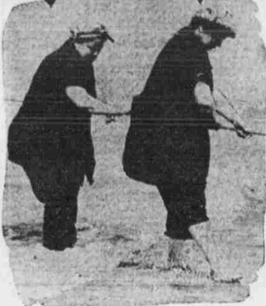
The Old-fashioned Bathing Costume, Which Is as Offensive in the Eyes of Some as the Scanty Modern Attire Is to Others.