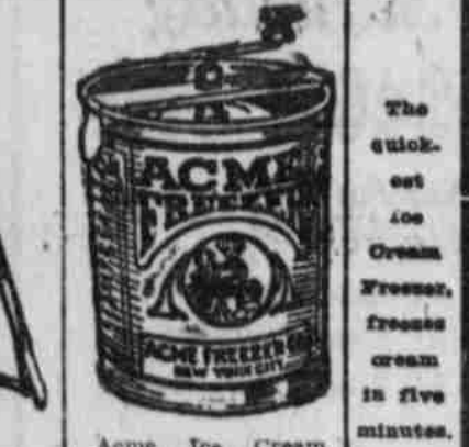
Acme Ice Cream Freezer, absolutely sanitary, no solder used on the inside of cream can, our price $4.95