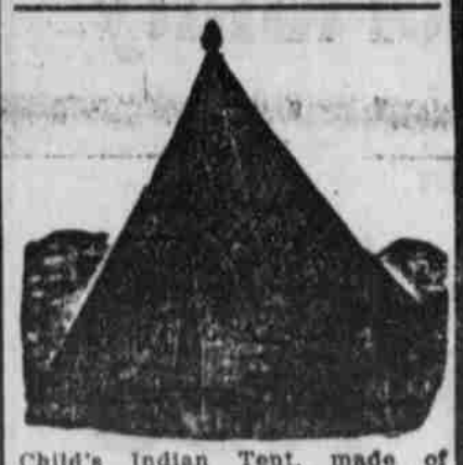
Child's Indian Tent, made of heavy canvas, nicely ornamented; complete with stakes, poles and rope; our price $1.10

See Our Beautiful Three-Room Home Outfits for $81