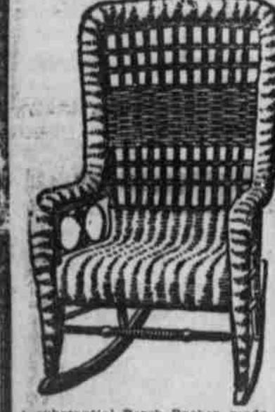
A substantial Porch Rocker, made of heavy fiber in the brown finish, exceptionally well made and with a solid, closely-woven back and seat, our price $1.95