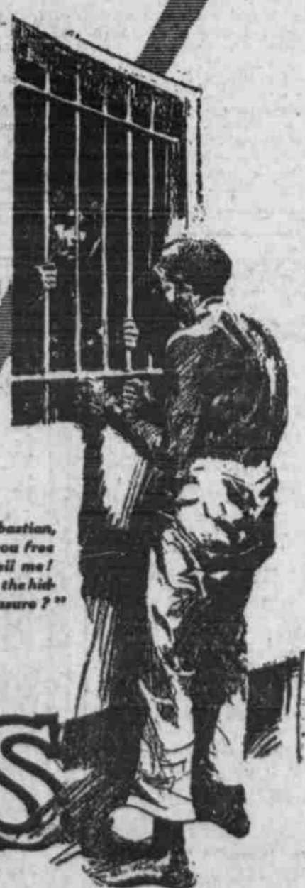
"Good Sebastian, I'll set you free if you tell me where is the hidden treasure?"

These are the real, flesh-and-blood people, drawn with Beach's characteristic insight into human nature. The story of young O'Reilly's departure from New York, and how, under suspicion alike by Spanish soldier and Cuban rebel, he starts his dangerous search for Rosa, will make the blood tingle. Begin