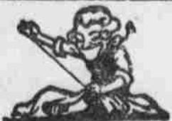
MADE TO ORDER

Remember that inside cleanliness is more important than outside, because the skin does not absorb impurities to contaminate the blood, while the pores in the thirty feet of bowels do.—Advertisement.