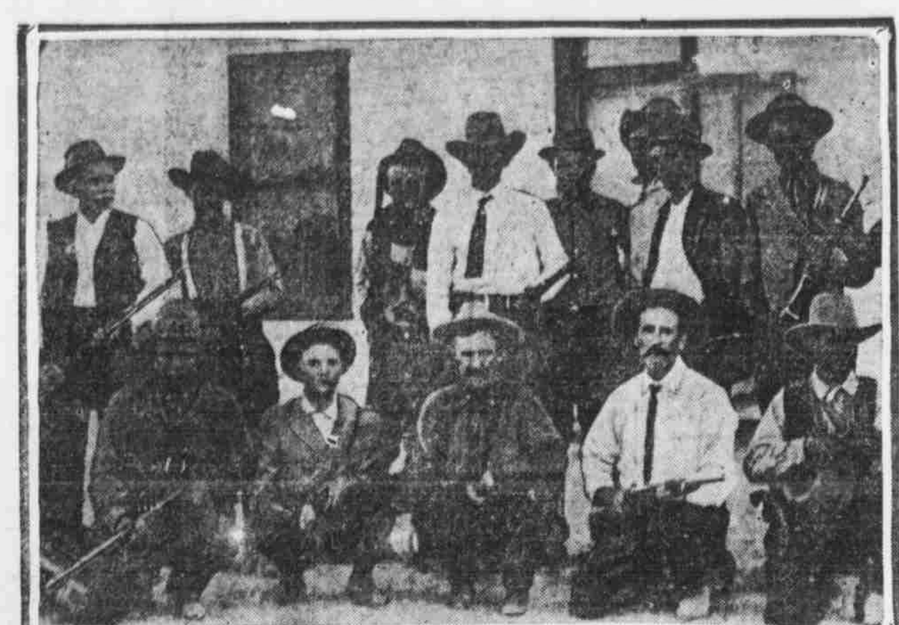
COLUMBUS, N.M. HOME GUARD.

Following the border raid, in which six American soldiers and nine troopers were murdered, the civilians of the town, for the most part ranchers and railroad men, organized themselves against a repetition.