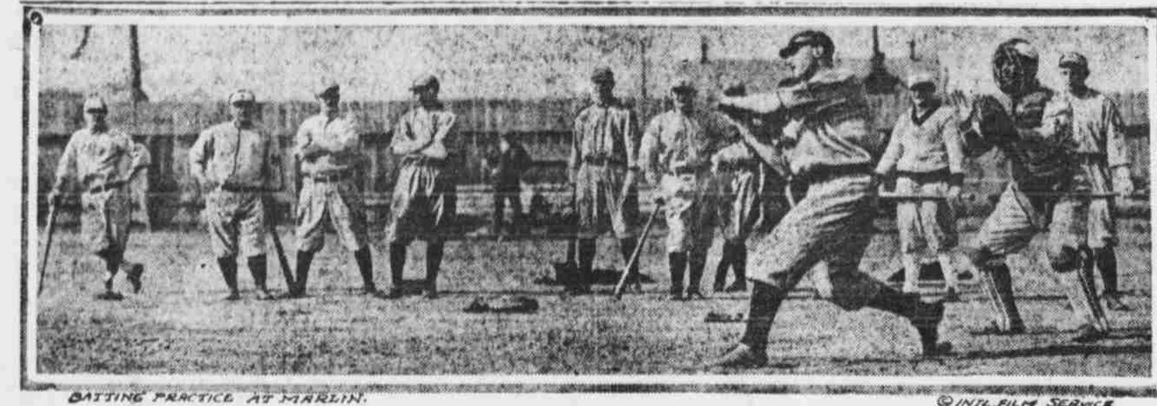
The base ball season is fairly opened. Most of the teams are now at their southern training grounds. John McGraw and a squad of Giants and near-Giants, and many-never-be-Giants are coveting over the practice diamond at Marlin, Tex., and limbering up leg and arm muscles, stiffened by the winter's period of inactivity. This picture shows the squad at batting practice.