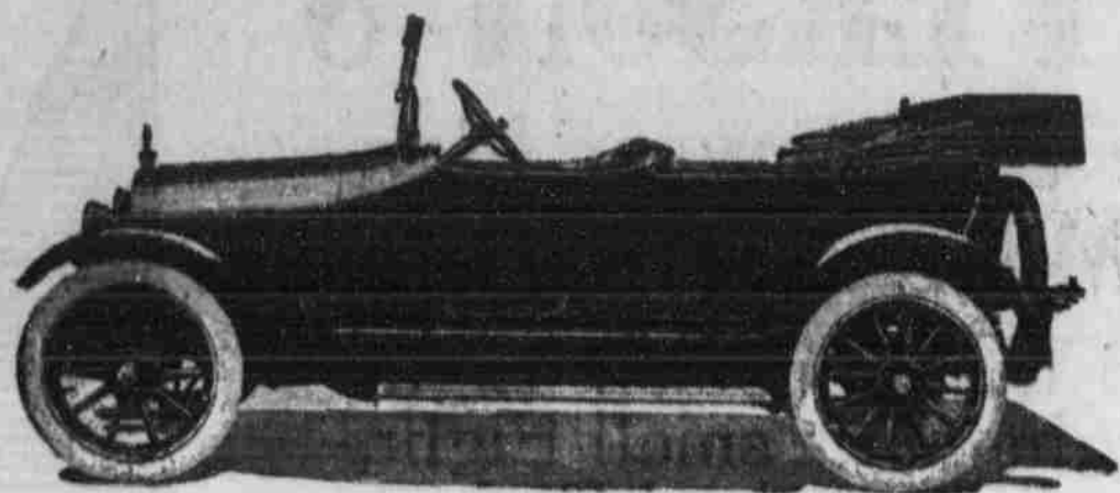
Stearns-Knight 4 Cylinder Model, $1395