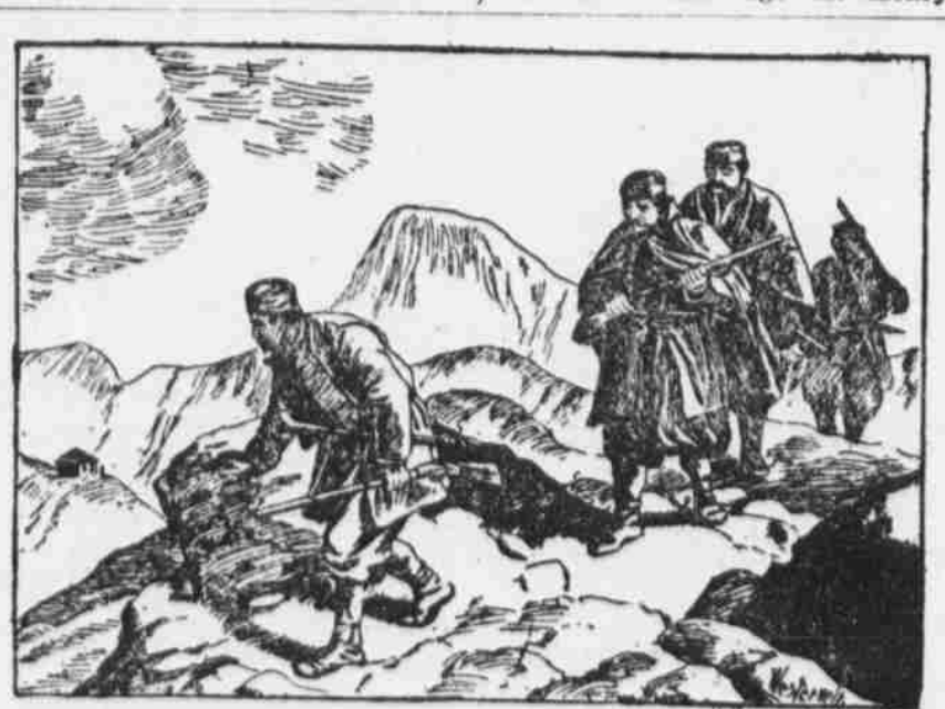
A Man Bunt in the Caucasus