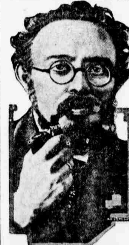
New portrait study of Carl Radek, Soviet leader, whose strong hand has often guided the Russian ship of state and kept it off the rocks.