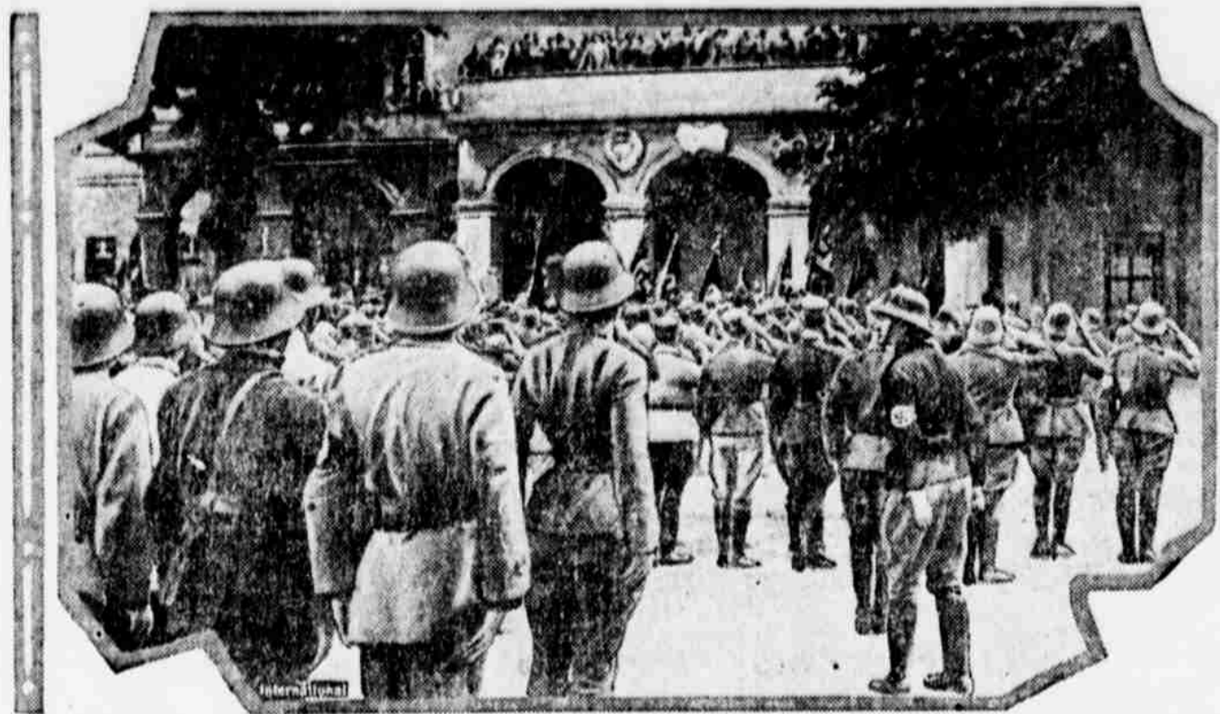
Adolph Hitler, leader of the Bavarian Fascists, does not rely wholly on that organization in his efforts to restore the German monarchy. A large number of Austrian troops are said to be allied to his royalist party, and they wear the swastika, emblem of the Bavarian Fascist. Hitler is shown in this photograph reviewing these Austrians at Salzburg.