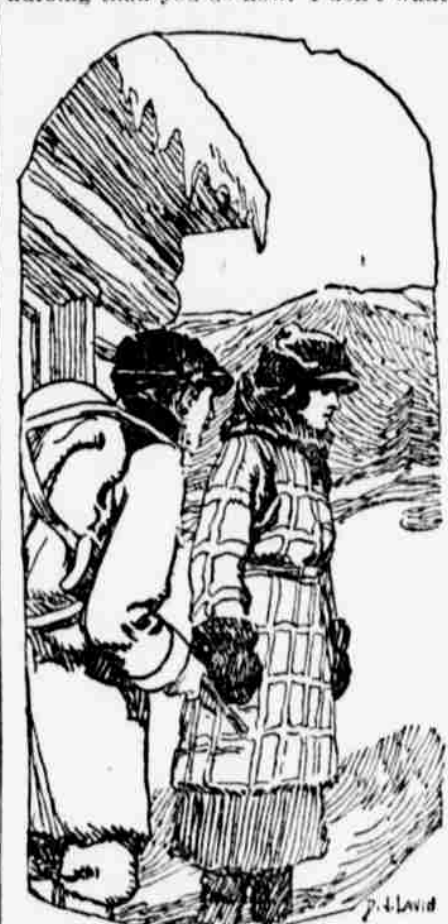
"Don't Waste Time. There Will Be Snow Today."

"It is impossible for you to stay here," said he in a voice of command. "You are not fit to take care of yourself, and I can't stay and take care of you. You must come with me. I think you can manage that. Your husband-if he is your husband-is dead. It may or may not be a matter for sorrow to you, but I should say that it ought not to be anything but a merciful release. Women are queer creatures, though. . . . However, whether you are in grief or in rejoicing, you can't stay here. By tomorrow or next day you'll need more nursing than you do now. I don't want