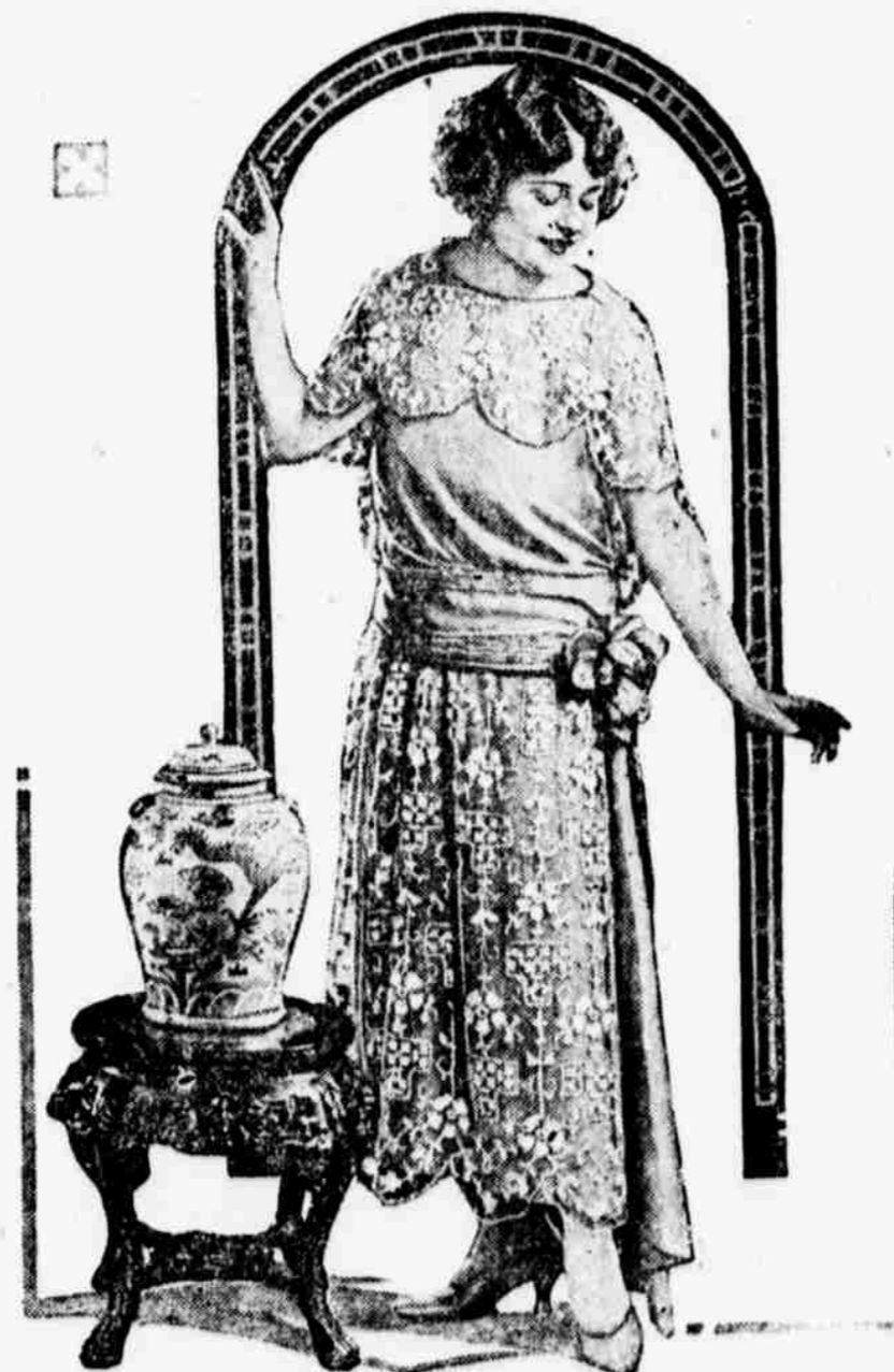
Of Lace and Crepe de Chine.

pictured it is used for an overskirt, a trifle fuller than the underskirt of crepe de chine, and hanging straight to the ankles. It also forms a cleverly designed drape for the short-sleeved slip-over bodice of the crepe de chine. This drape is in the effect of a bertha at the front and a cape at the back. The bodice has no girldie but groups of shirtings at the front and back serve to suggest one. A very long floating panel of the crepe de chine falls from a cluster of gorgeous still