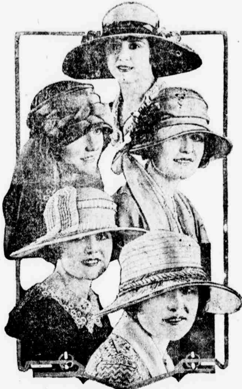
Group of Pretty Summer Hats.

Wide lace flouncing makes a part of the fabric displays everywhere and it is shown in many colors. In the gown