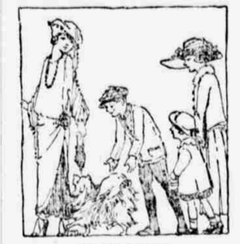
"A Little Dog."

Of course he knew that there were big weather bureaus where they studied the Wind and the Clouds and the Sun and the condition of the At-